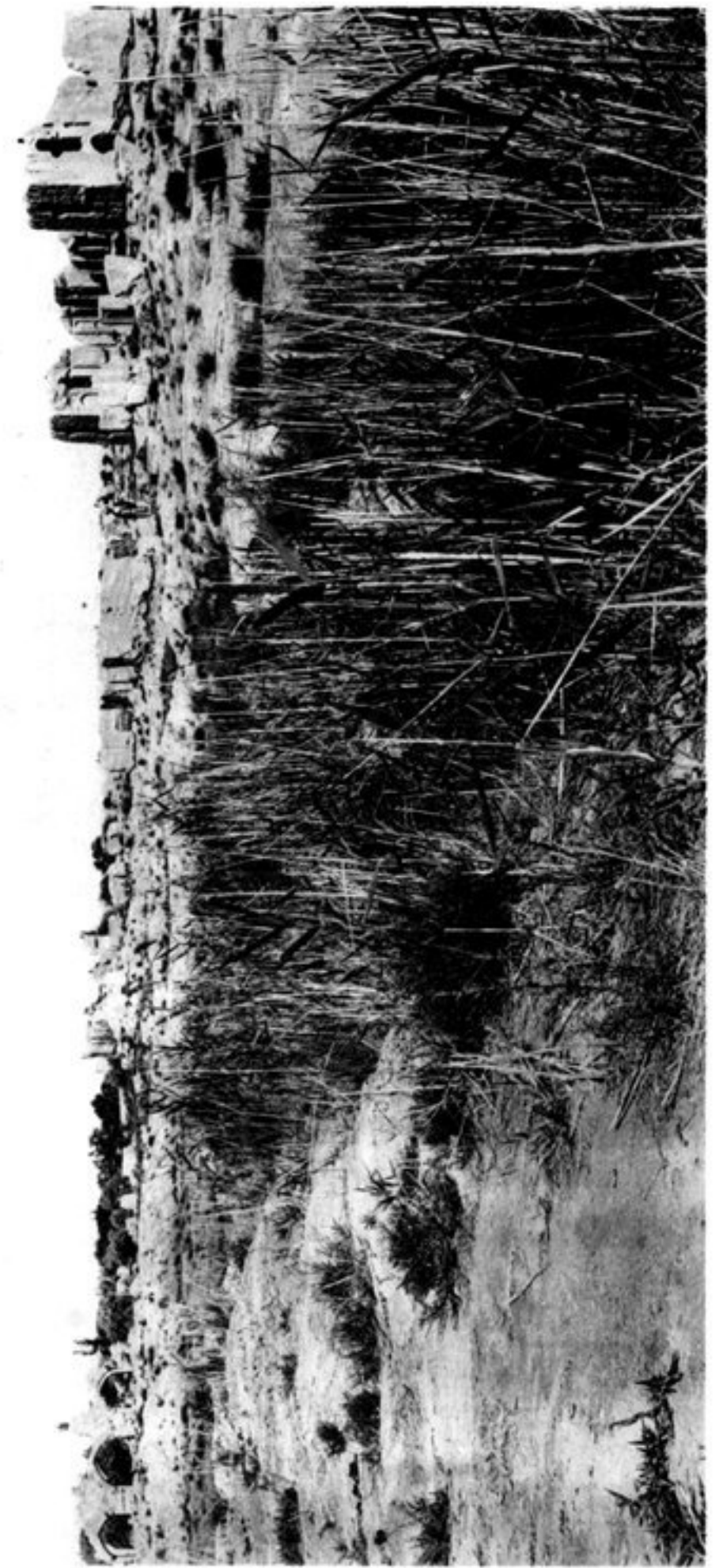
c) RUINES DE LA VILLE MODERNE.