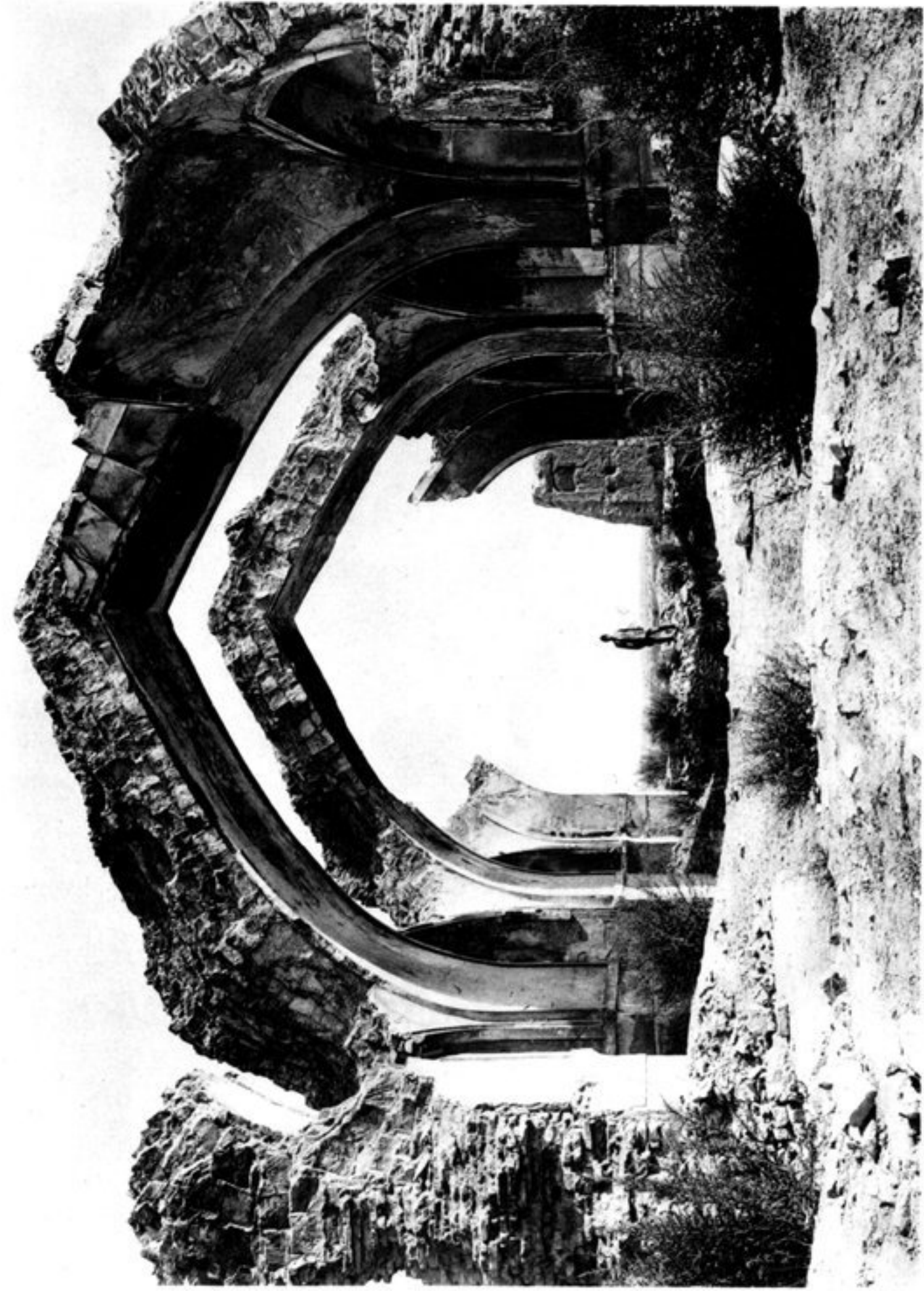
b) MOSQUÉE DU QUARTIER OUEST.