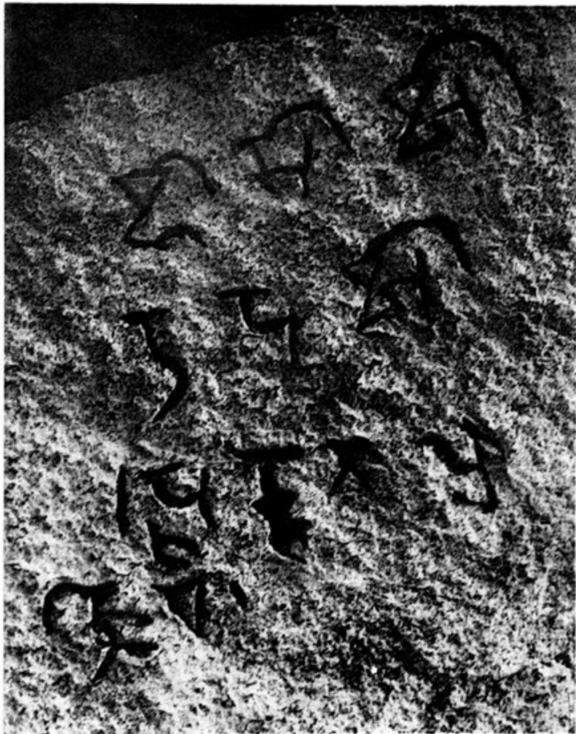
b) n° 6