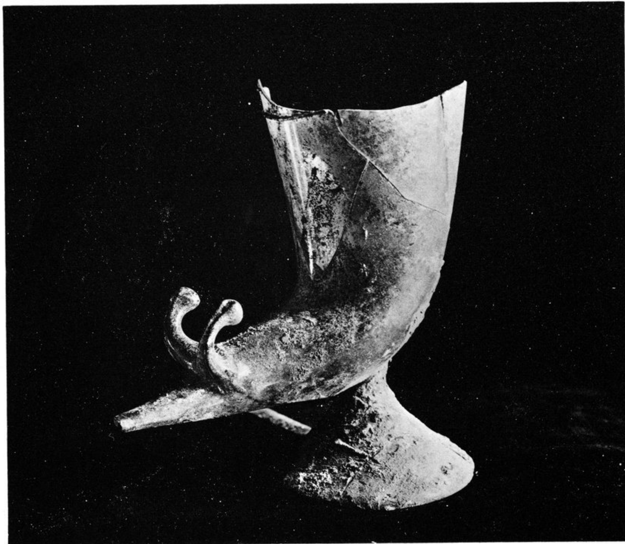
FIG. 7. — N° 158 [9]