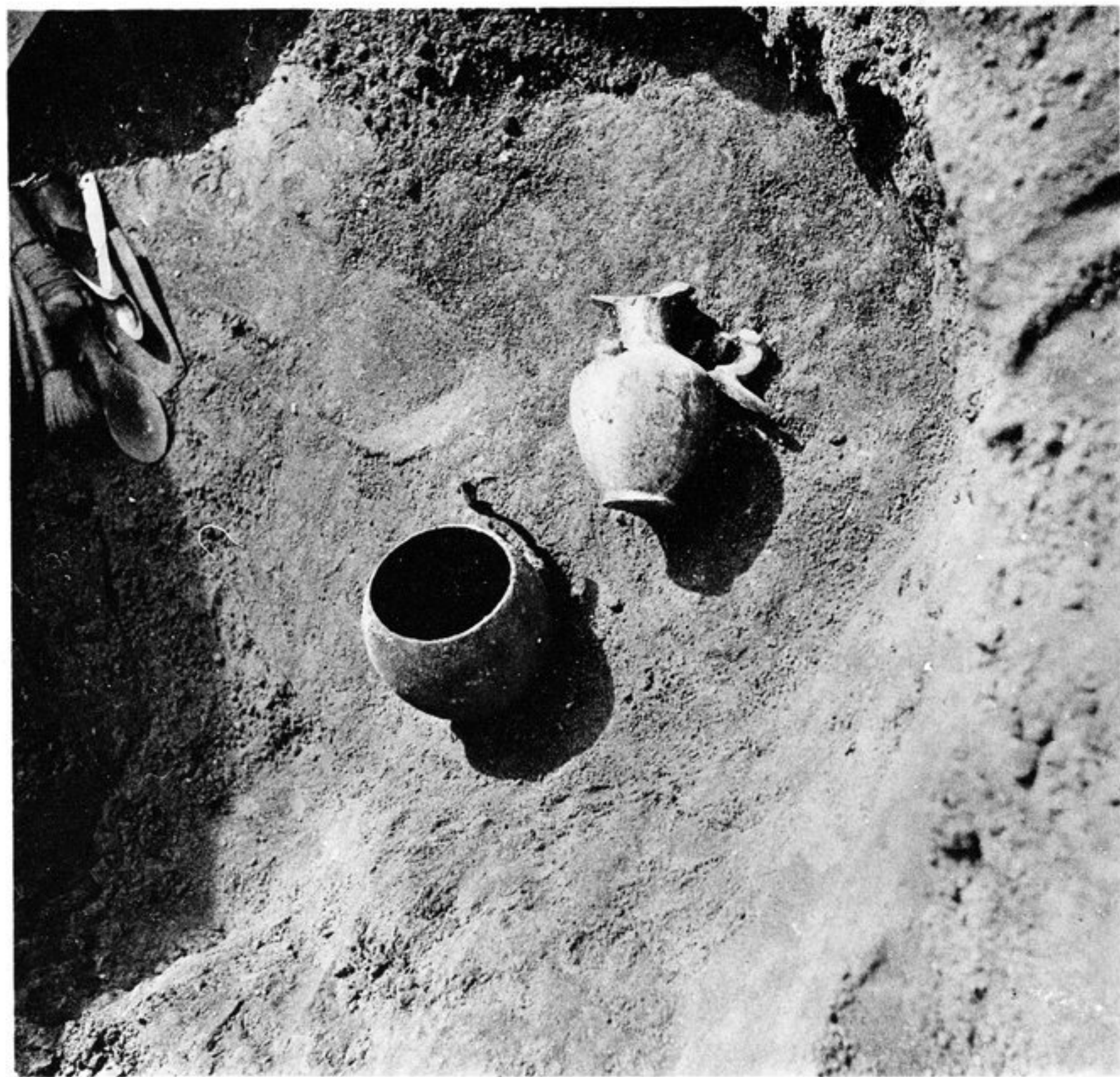
FIG. 15. — N° 172 [25] ET 173 [26]