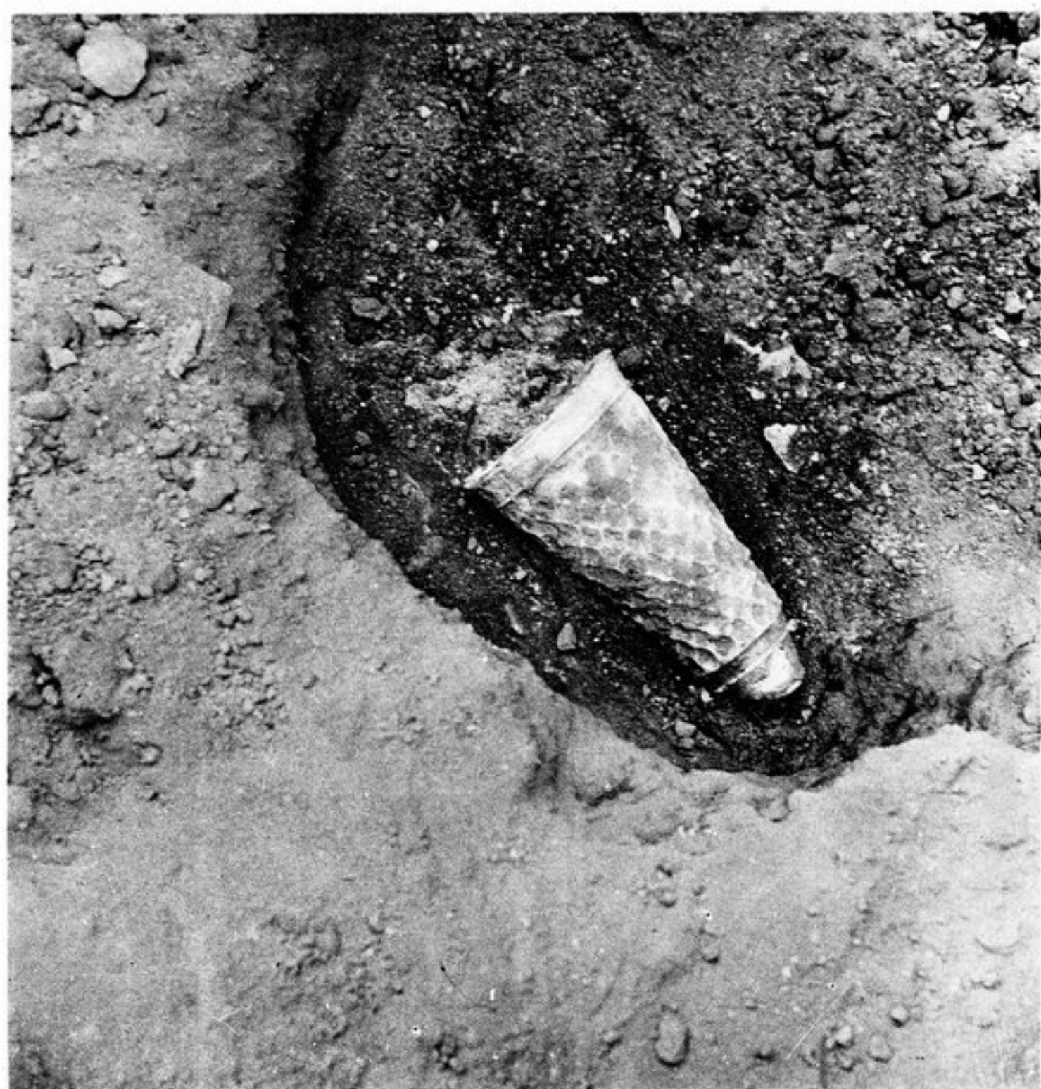
FIG. 21. — N° 175 [28]