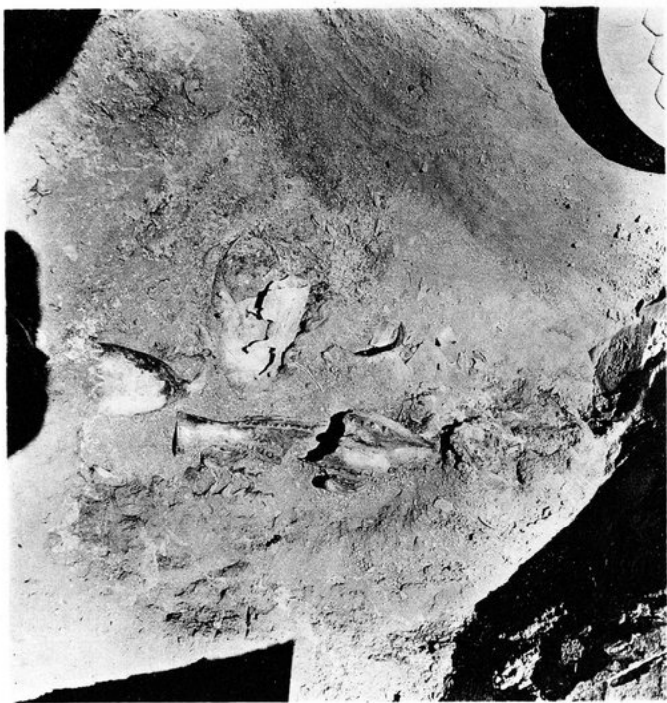
FIG. 24. — N os 193 [46] ET 203 [56]