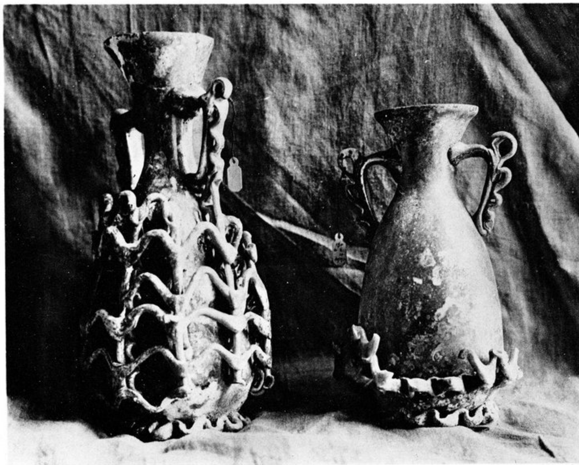
FIG. 23. — N os 192 [45] ET 190 [43]