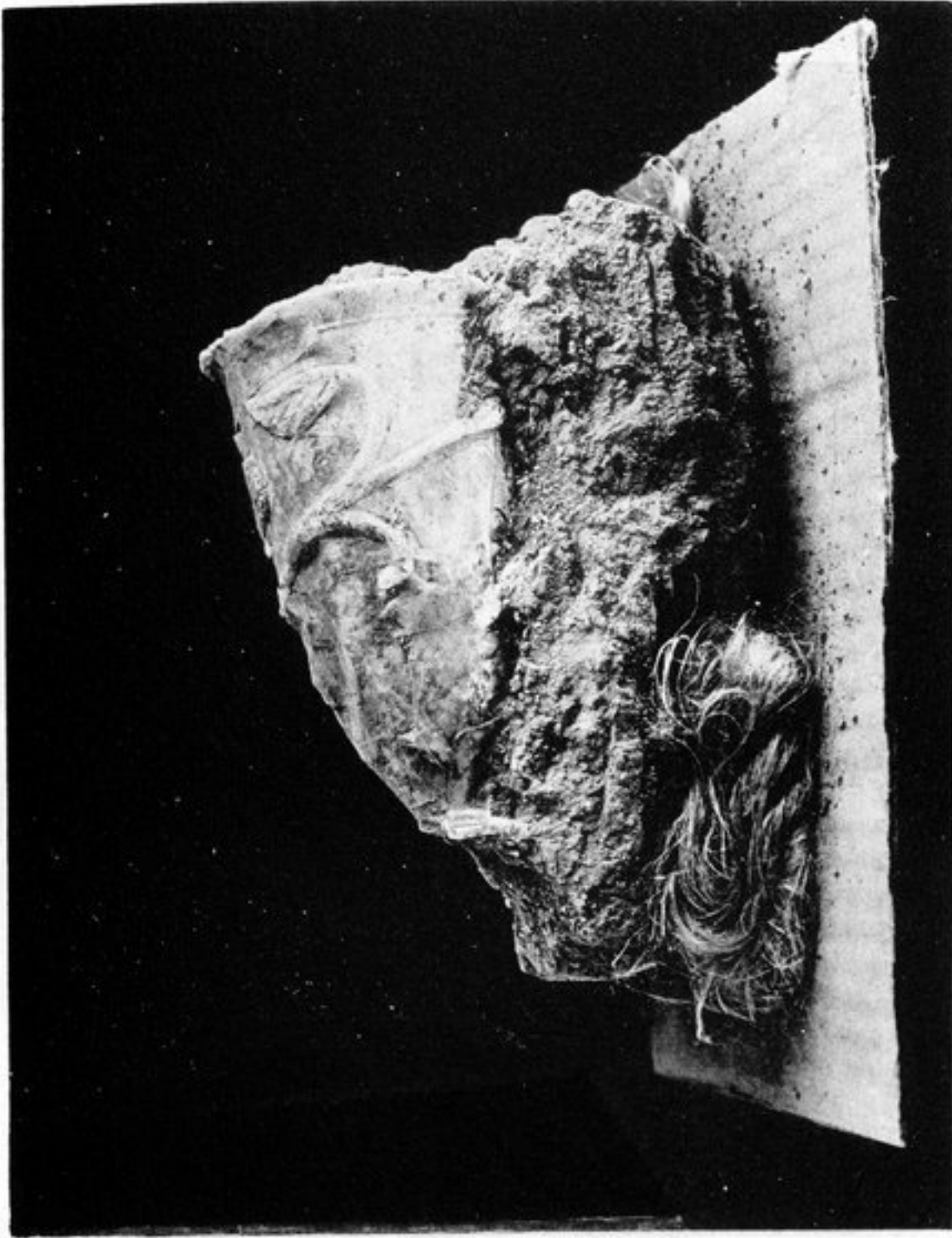
Fig. 54. — N° 237 [91]