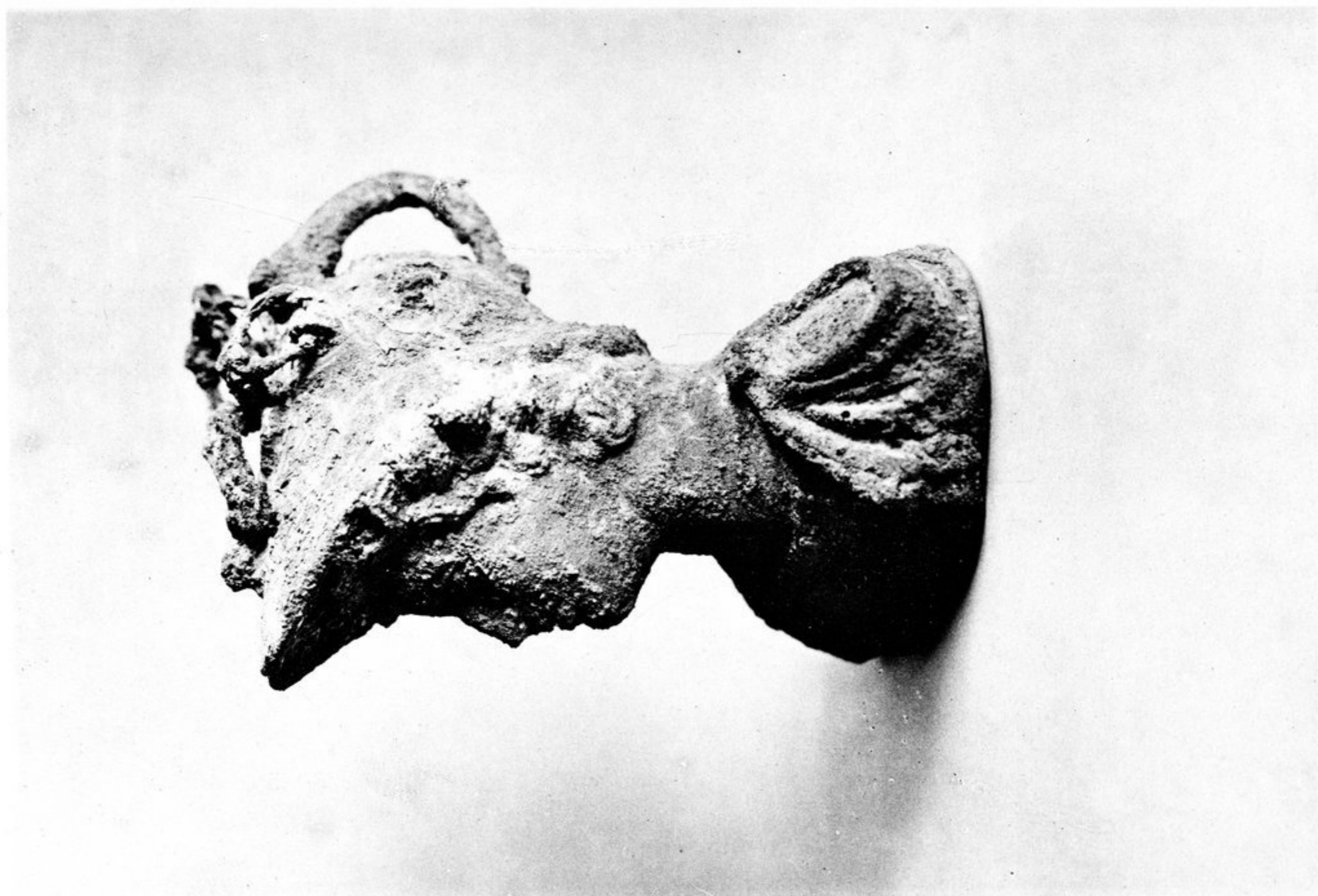
FIG. 56. — N° 240 [94]