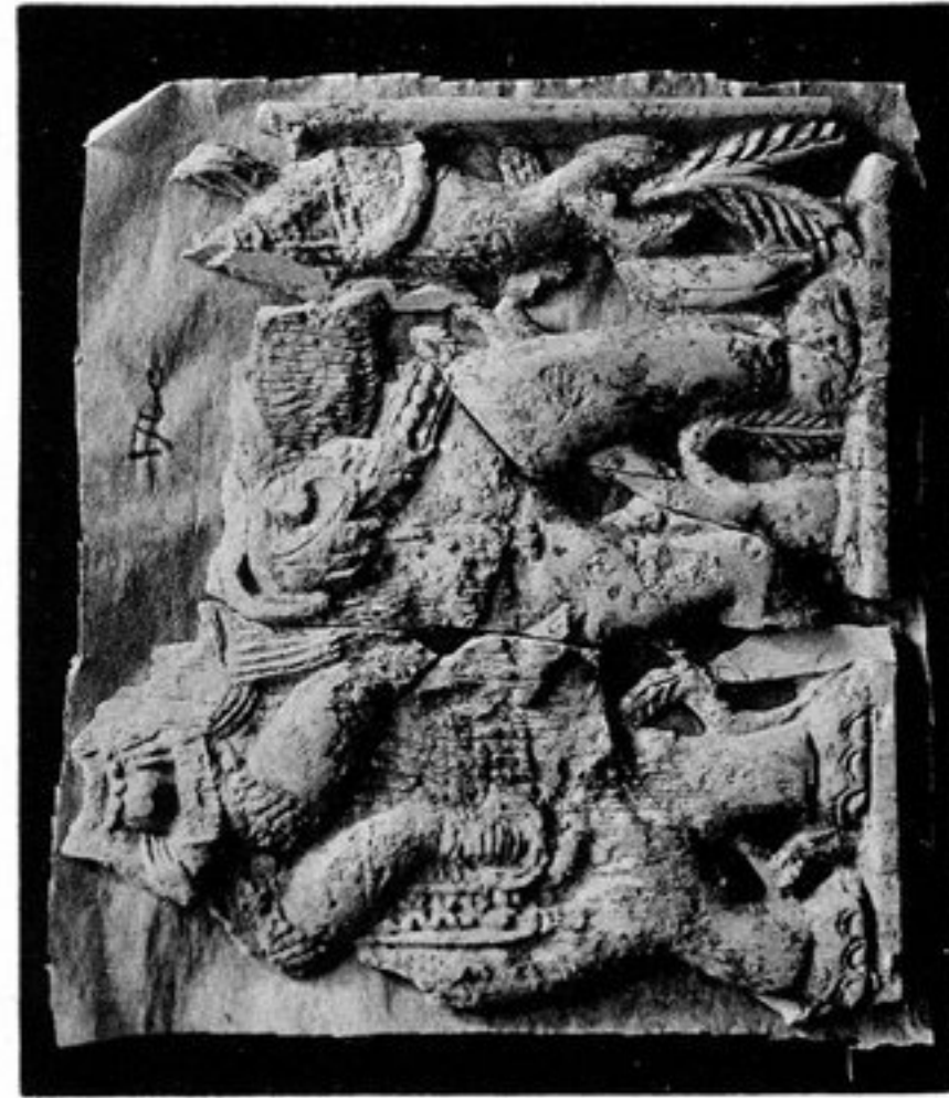
Fig. 104. — N° 322 [176, a]