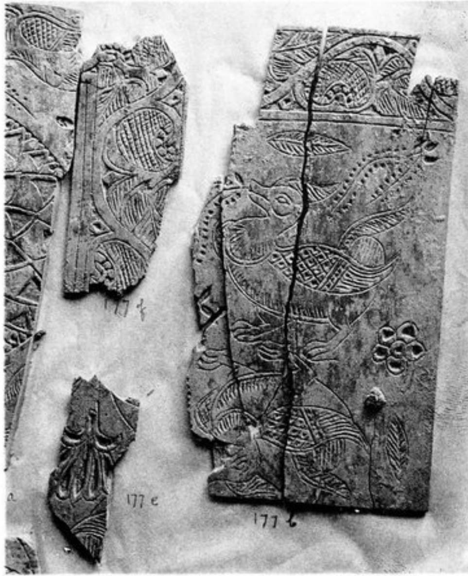
Fig. 106. — N° 323 [177. b, e, f]