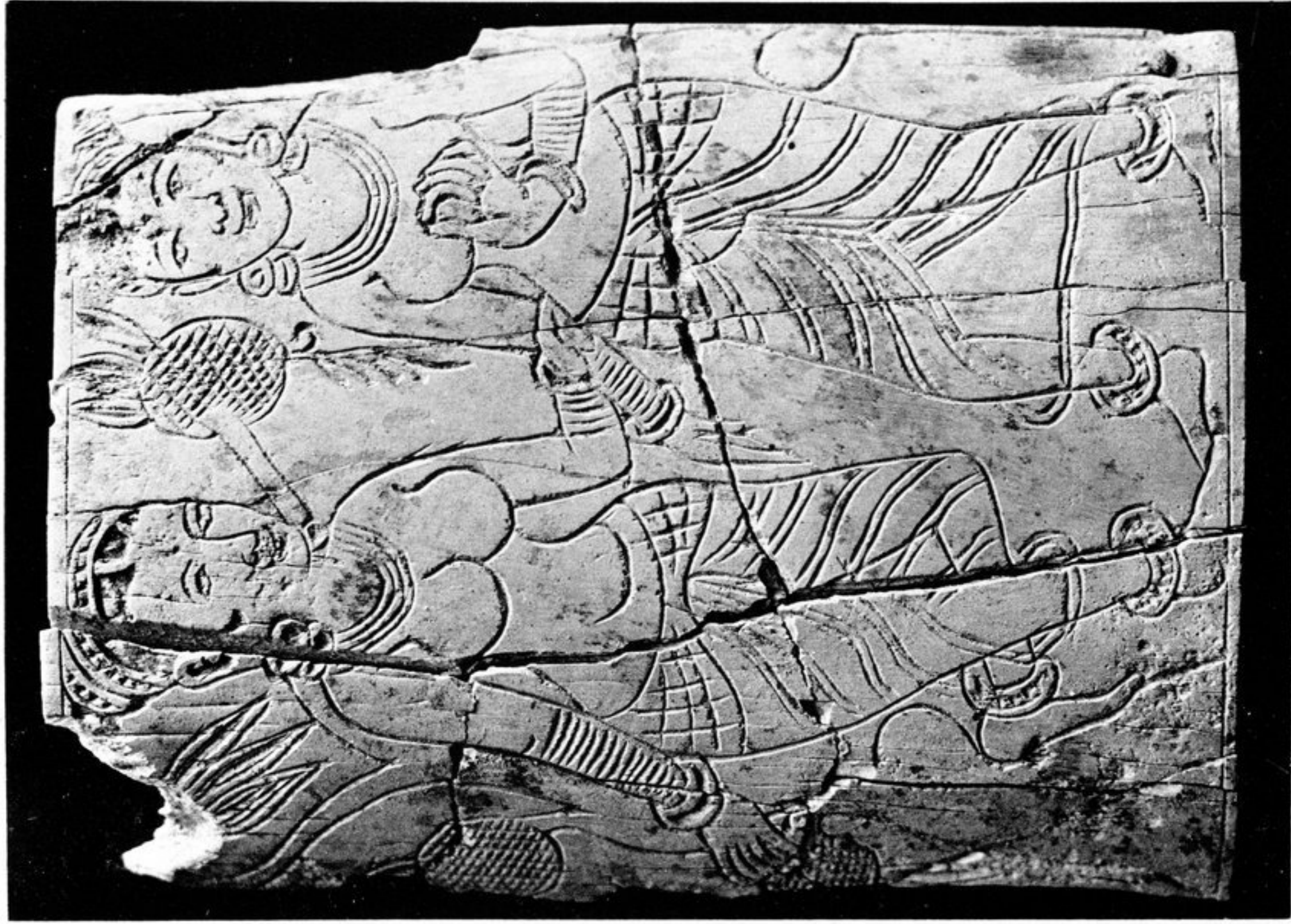
Fig. 107. — N° 316 [170]