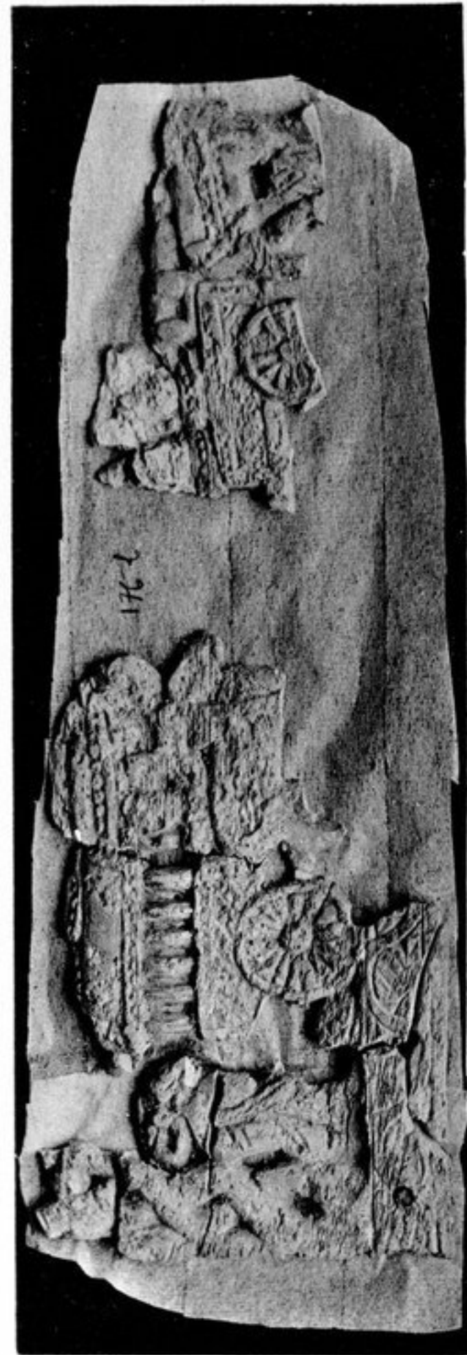
Fig. 105. — N° 322 [176, b]