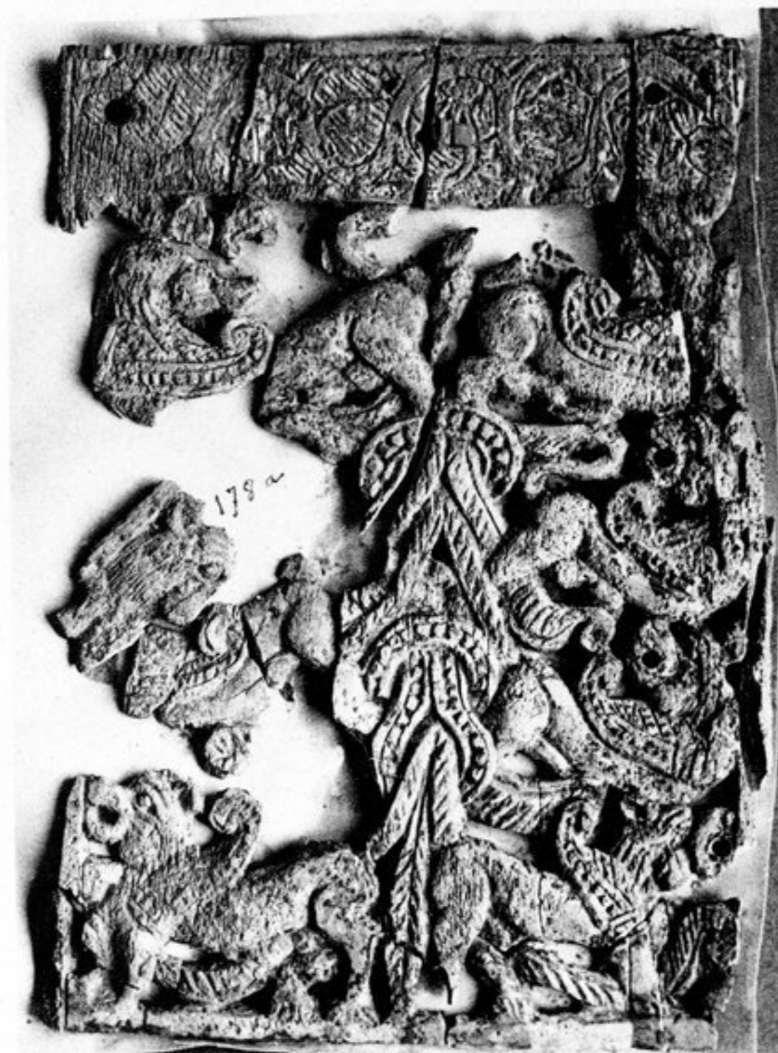
FIG. 110. — N° 324 [178. a]