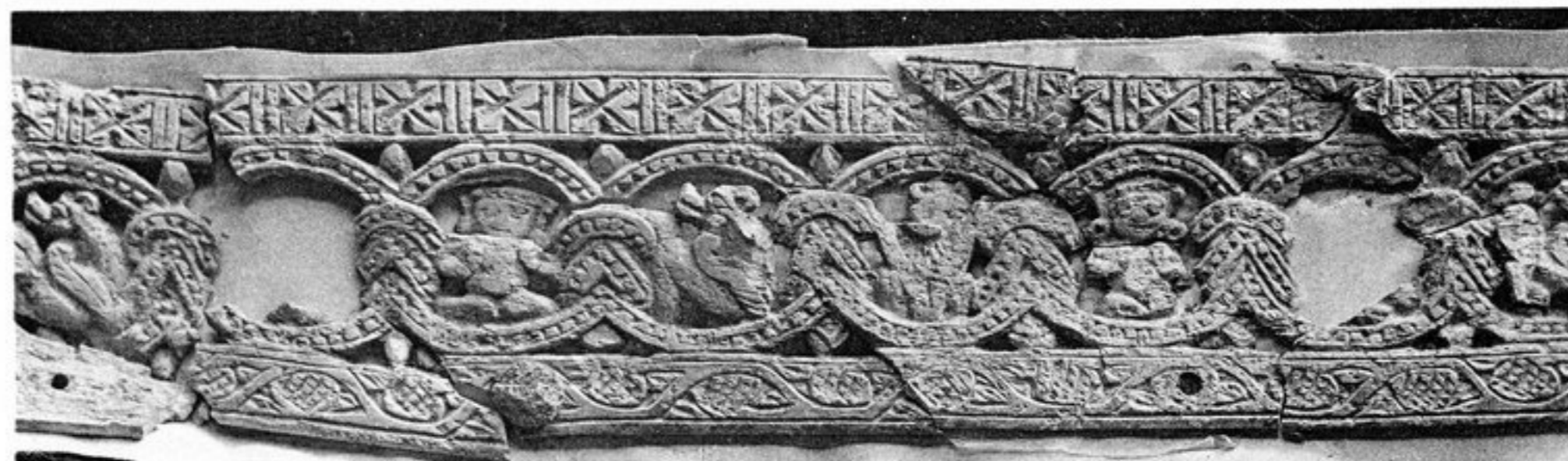
FIG. 108. — N° 324 [178. d]