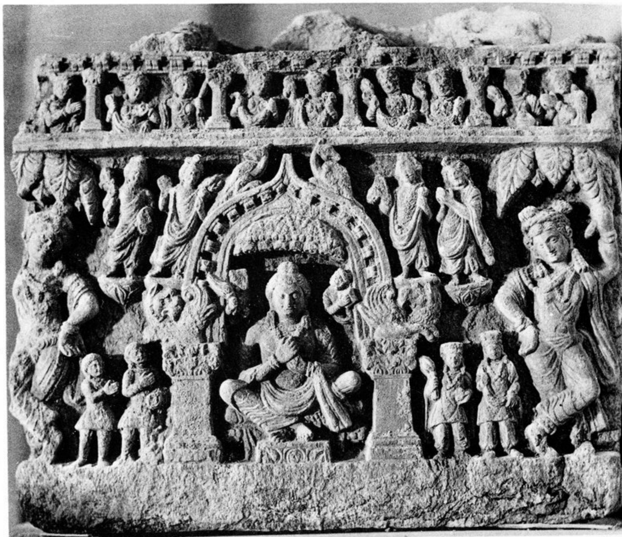
FIG. 109. — SHOTORAK