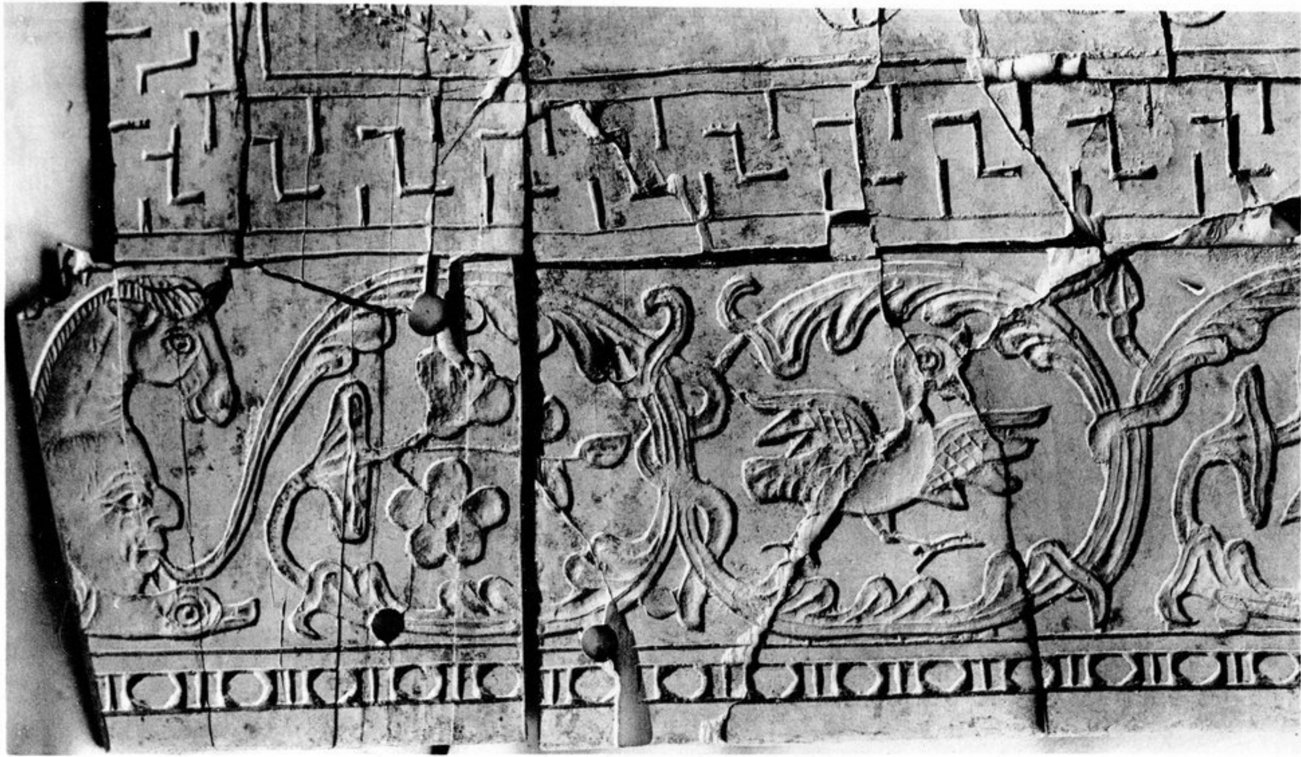
FIG. 183. — N° 329 [183, b]