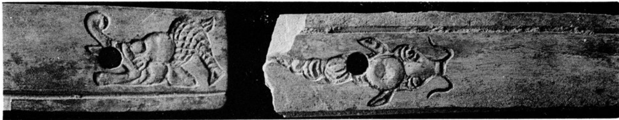
FIG. 187. — N° 329 [183, g 1]