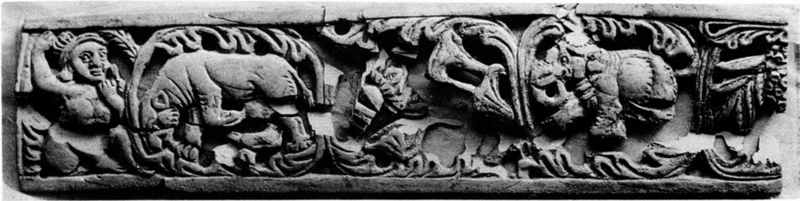
FIG. 186. — N° 329 [183, e 1]