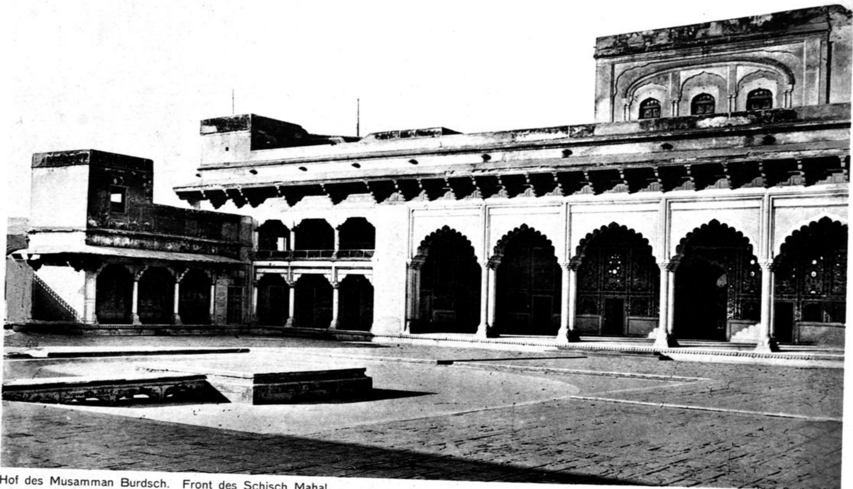
Hof des Musamman Burdch. Front des Schisch Mahal.