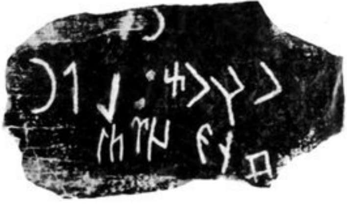
1 (Us. 0.).