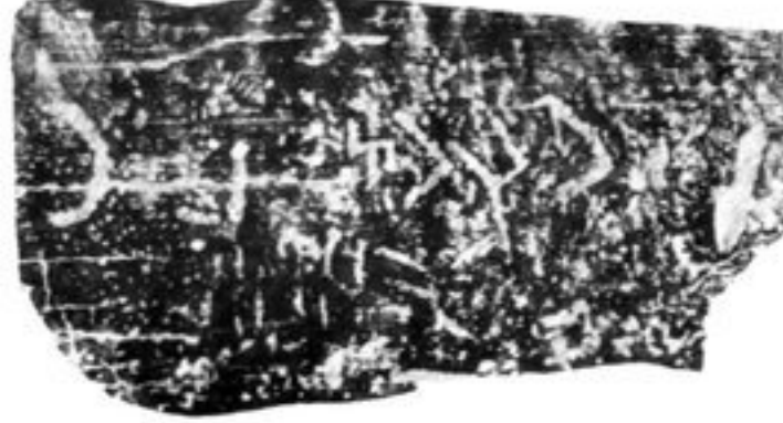
2 (Us. 0.).