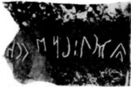
10 (T. 6-7).