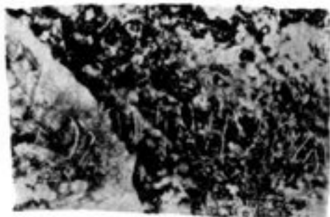
9 (T. 6-7).