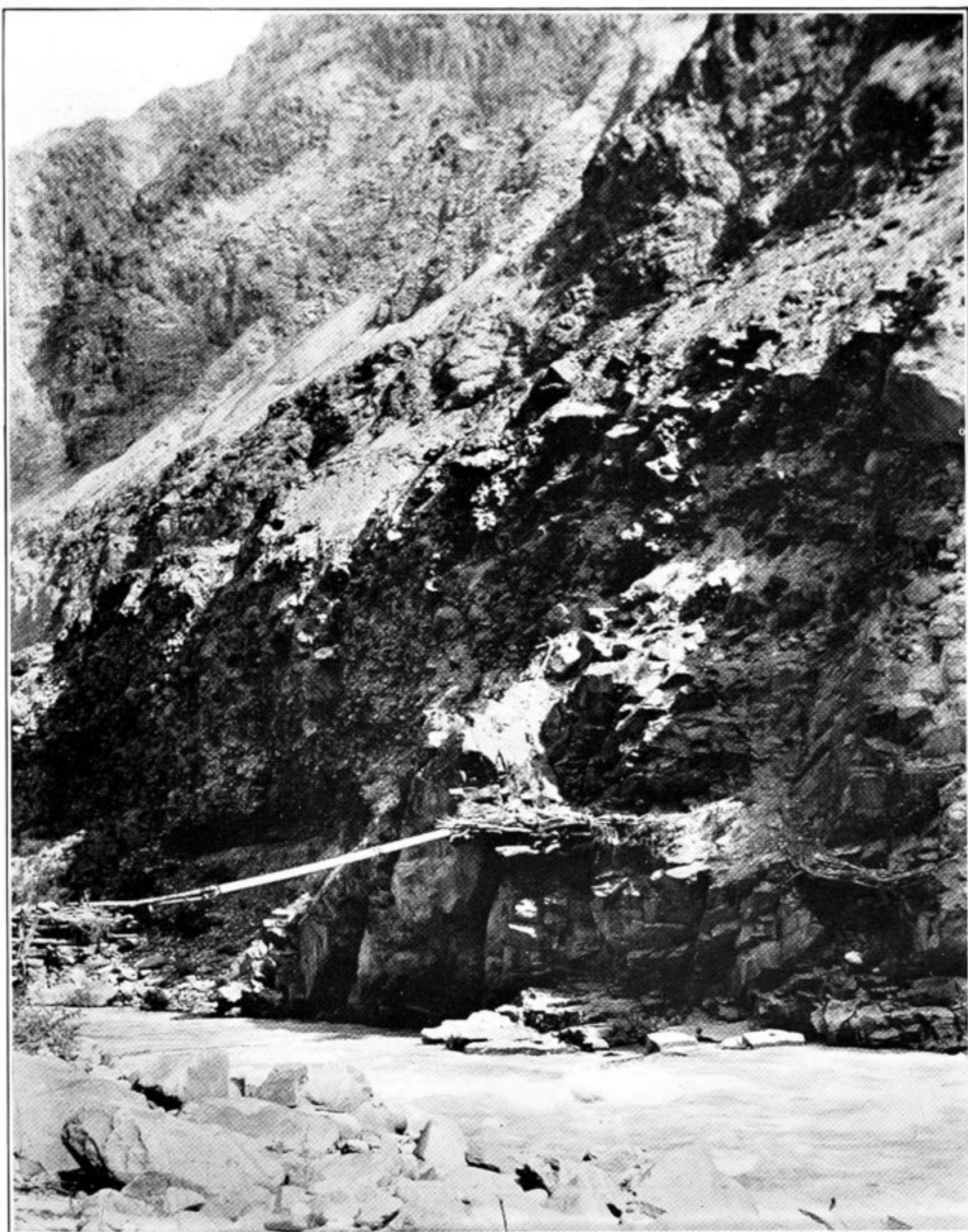
54. BRIDGE AND 'RAFİK' ON KARA-TÄSH RIVER AT BAKUCHAK