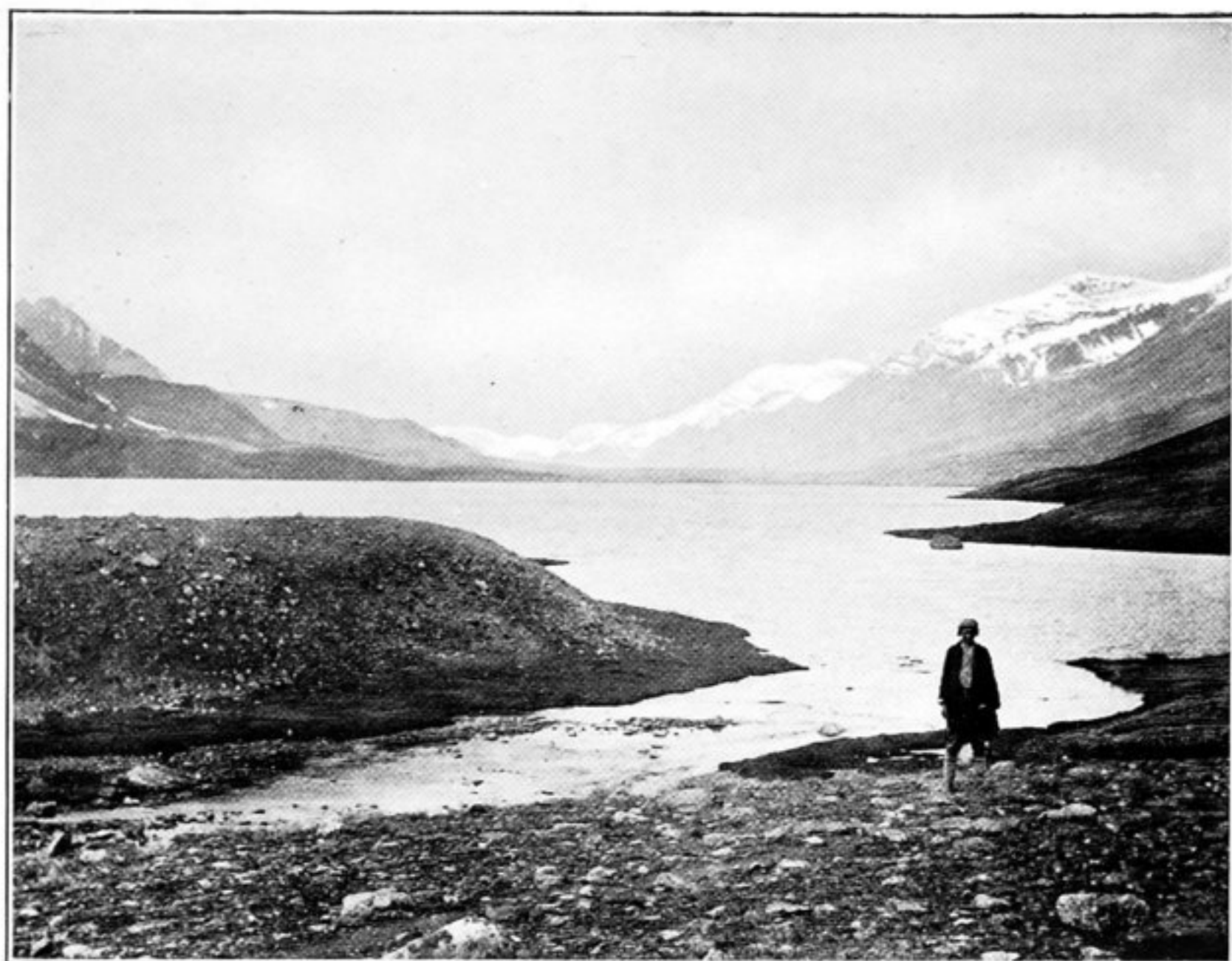
56. VIEW EASTWARDS ACROSS LAKE FED BY EASTERN BRANCH OF KARAMBĀR GLACIER.