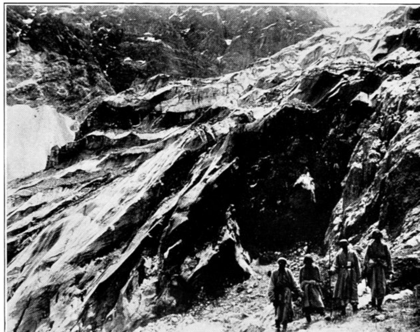
61. SNOUT OF GLACIER EAST OF CHILLINJI PASS, ABOVE BUATTAR.