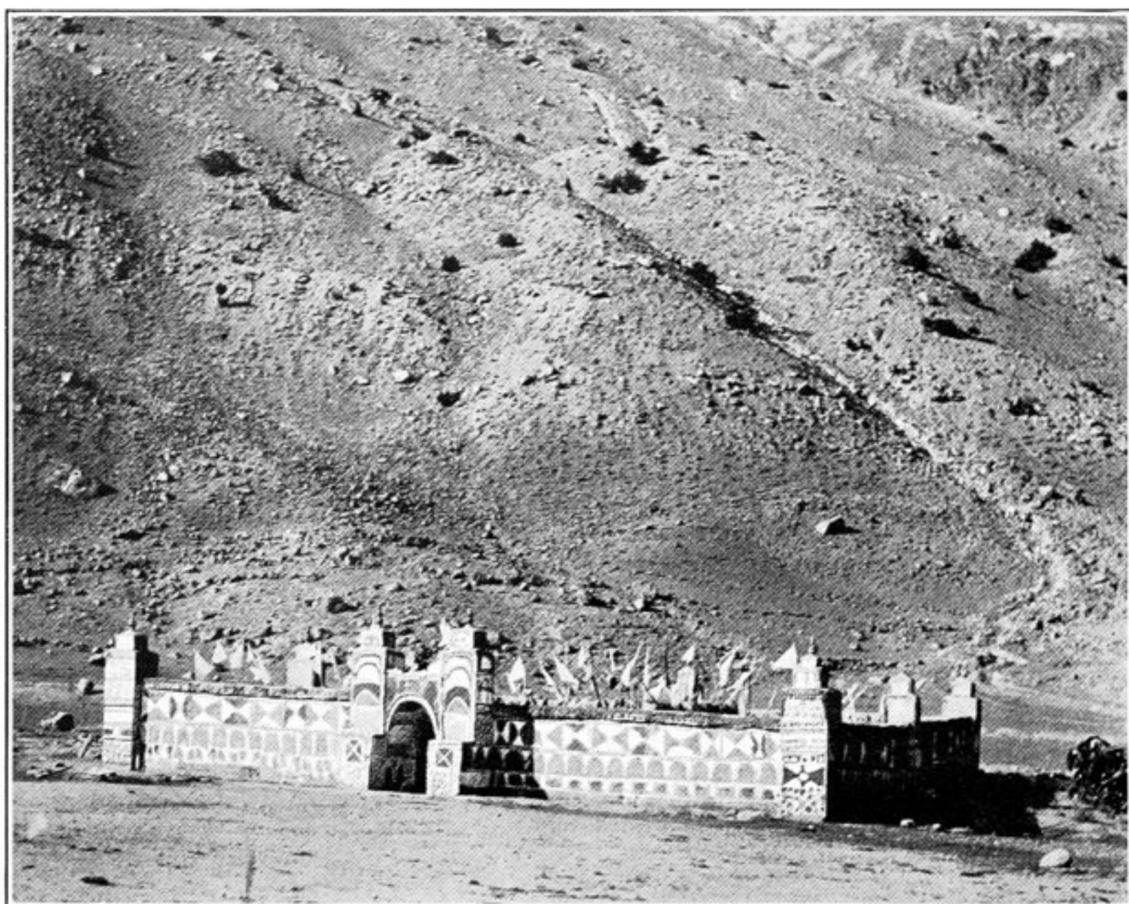
58. ZIĀRAT OF BĀBA-GHUNDI, CHAPURSAN.