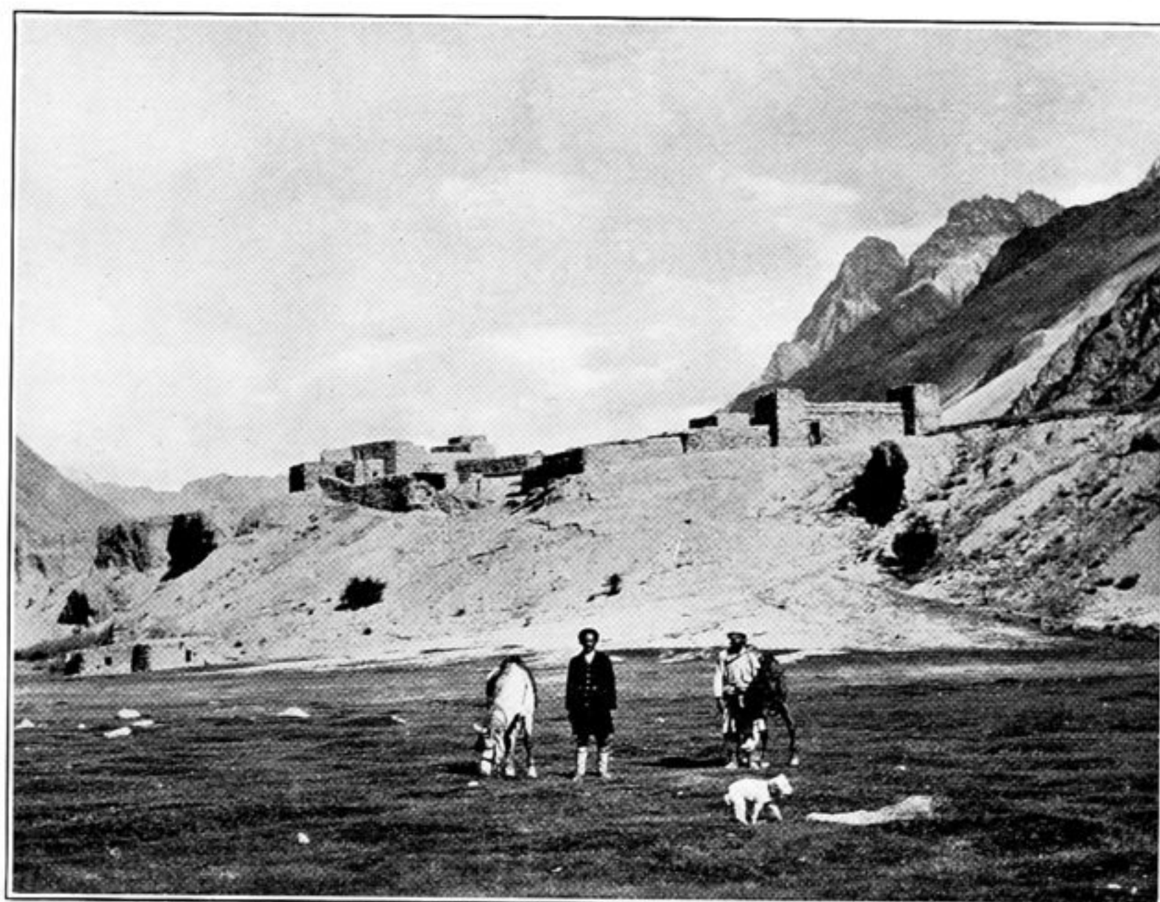
59. FORT VILLAGE OF RĒSHIT, CHAPURSAN VALLEY.