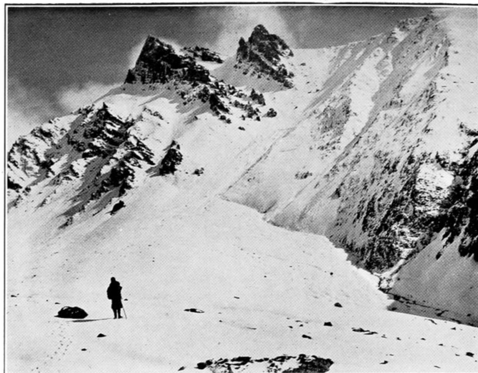
57. ROUTE OF ASCENT TO CHILLINJI PASS. Pass, about 17,500 feet above sea-level, marked by arrow.