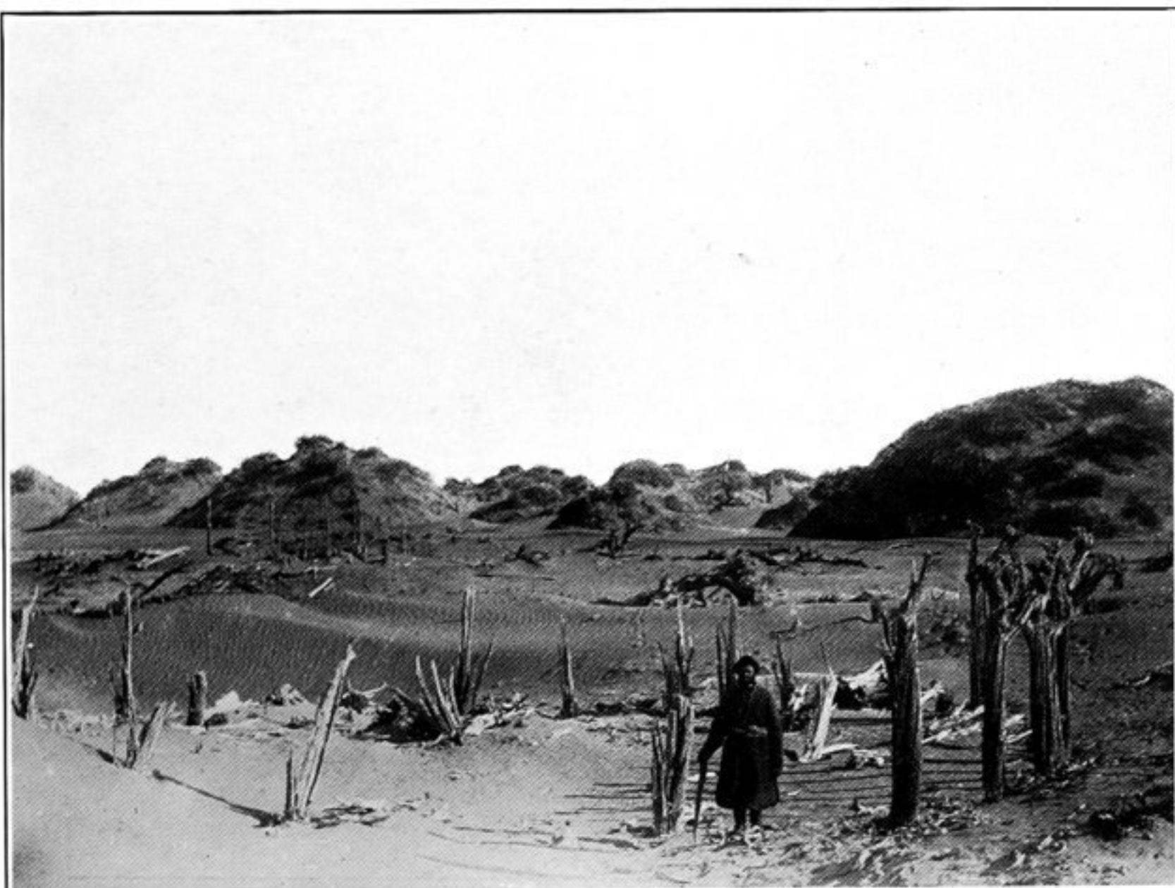
104. ANCIENT ARBOUR SURROUNDING TANK NEAR RUIN N. XLI, NIYA SITE. (See Serindia , i. p. 240.)