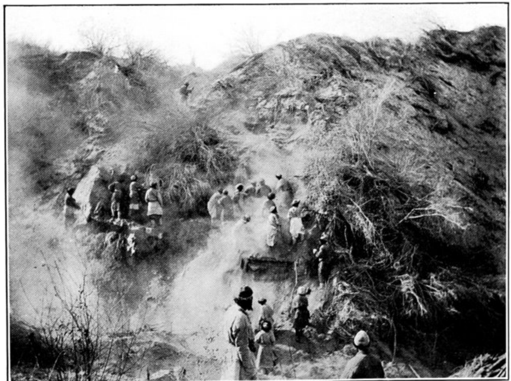
105. MEN AT WORK ON NEW BARRAGE ACROSS FLOOD-BED ABOVE TŪLKŪCH-TĀRĪM. (See p. 141.)