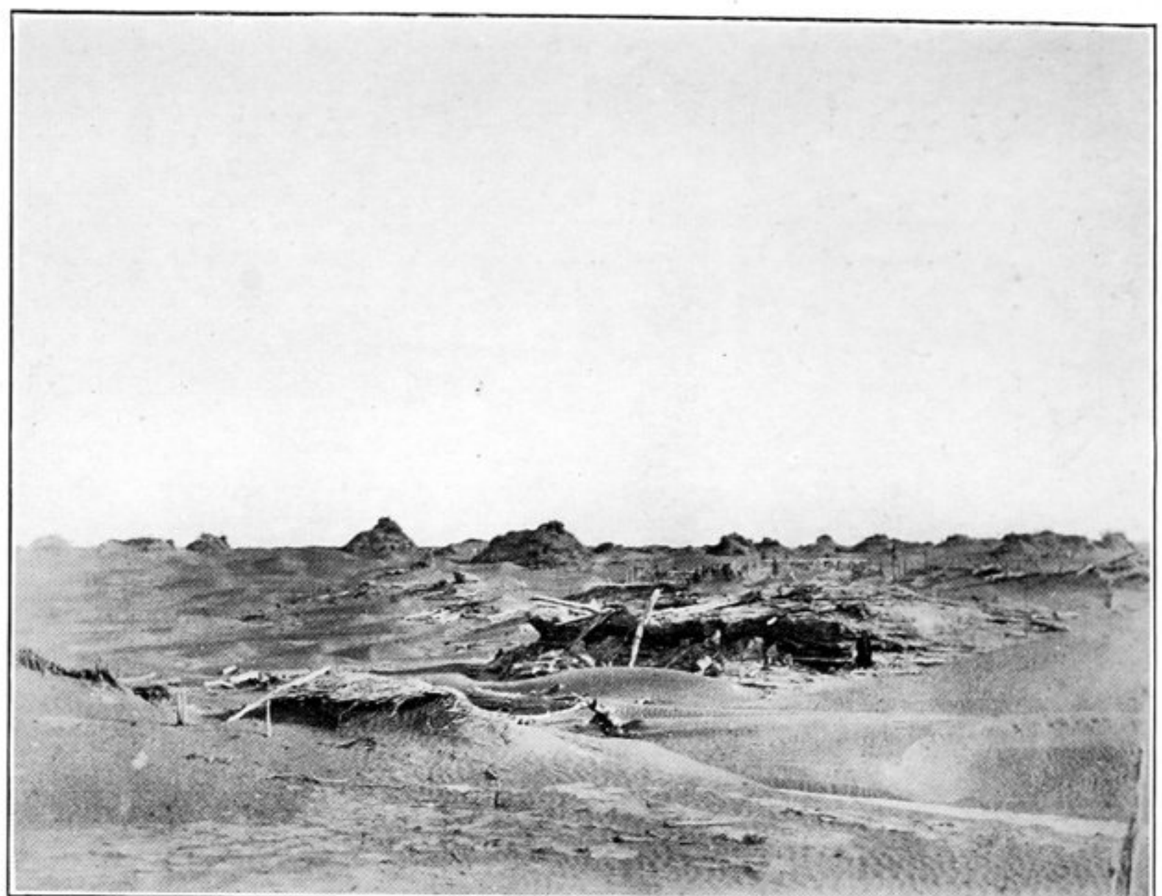
101. SITE OF RUINED RESIDENCE, N. III, NIYA SITE, SEEN FROM SOUTH-WEST.