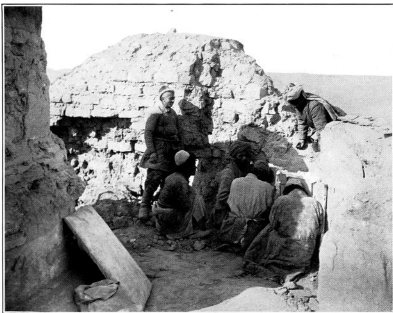
110. MEN REMOVING FRESCO PANELS FROM WALL OF SHRINE M. V, MĪRĀN SITE.