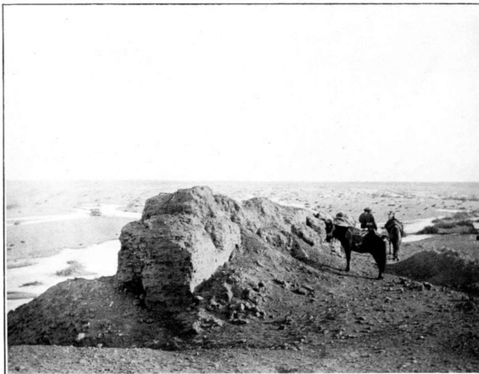
109. WALL NEAR CENTRE OF ENCLOSURE, BĀSH-KOYUMAL.