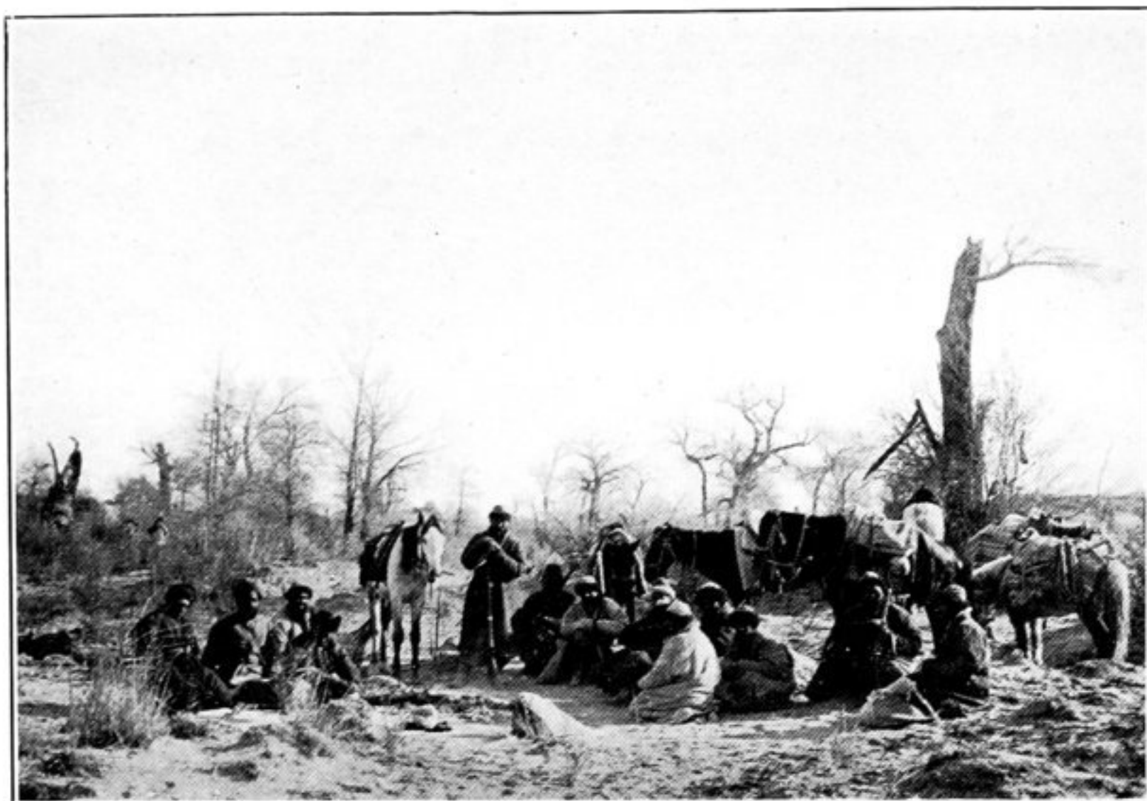
106. MEN OF VĀSH-SHAHRI GUARDING ROUTE FROM CHARCHAN. (See p. 159.)