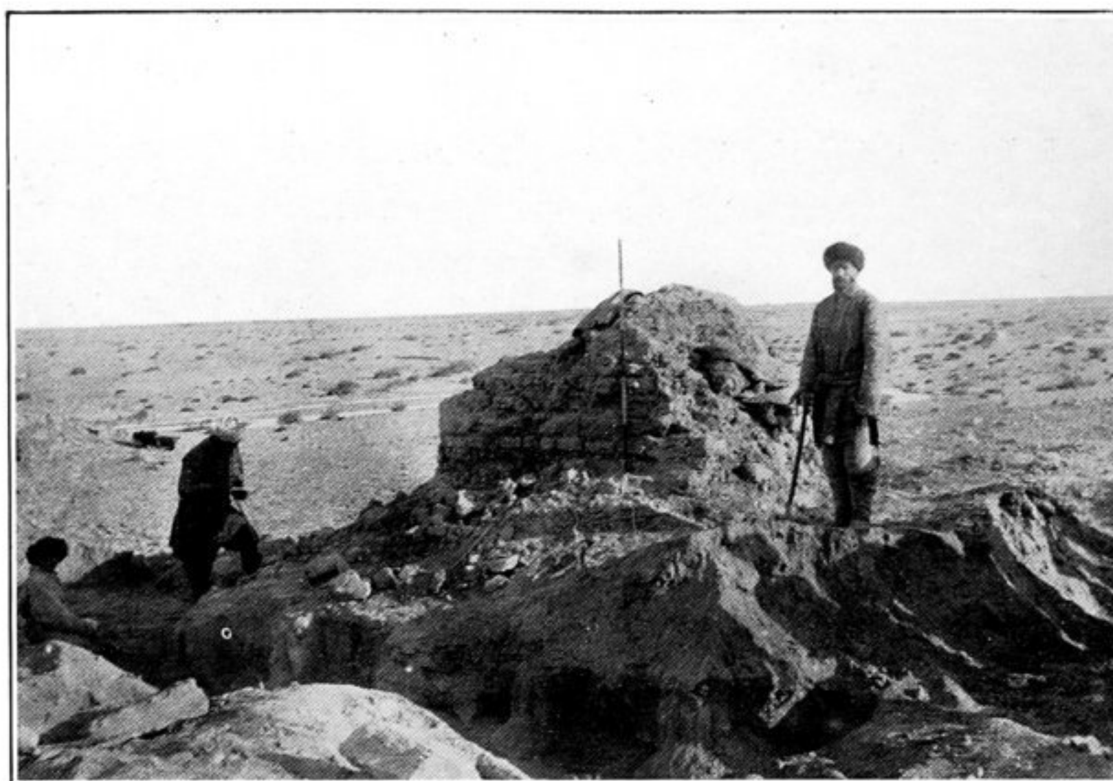
107. REMAINS OF SHRINE OR STŪPA AT BĀSH-KOYUMAL, SEEN FROM NORTH-WEST.