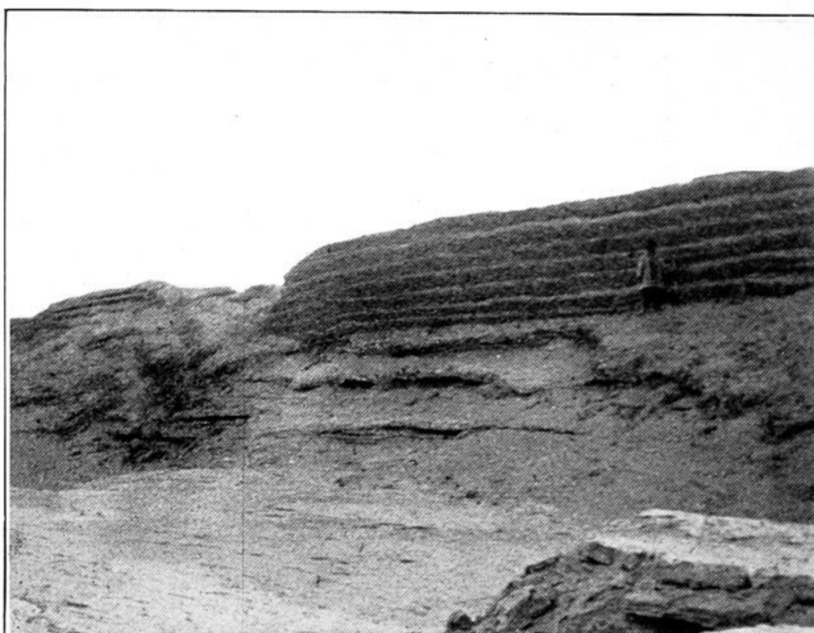
163. PORTION OF EAST RAMPART OF ANCIENT CASTRUM L.E., SEEN FROM WITHIN. (Man on right stands on original ground level.)