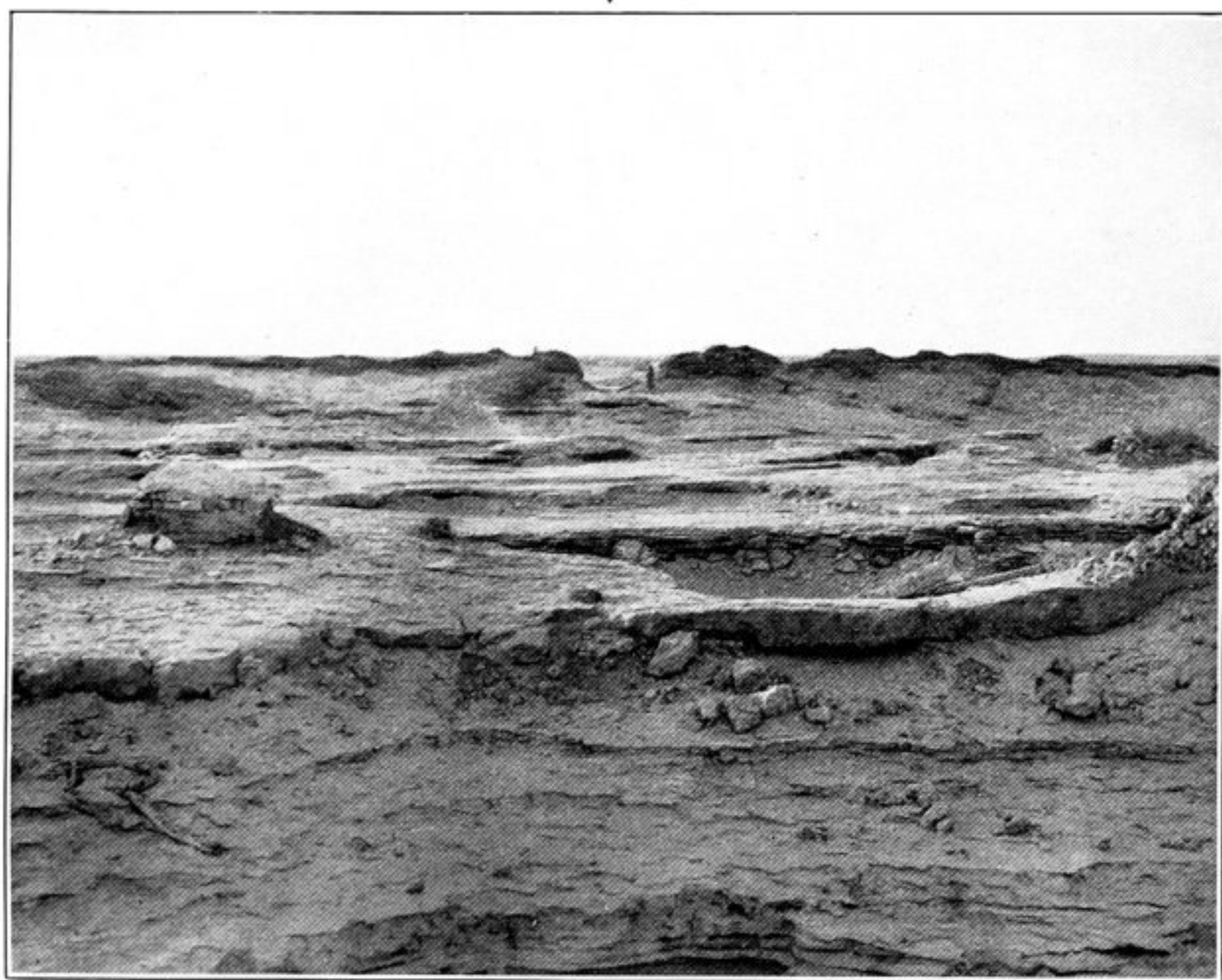
160. VIEW ACROSS INTERIOR OF ANCIENT CASTRUM L.E., FROM NORTH. Position of main gate marked by arrow.