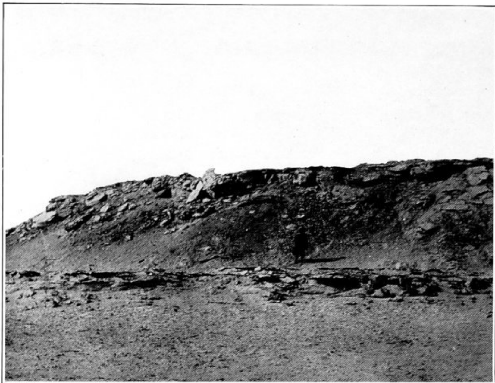
158. WESTERN PORTION OF MESA L.C., SEEN FROM SOUTH-EAST.