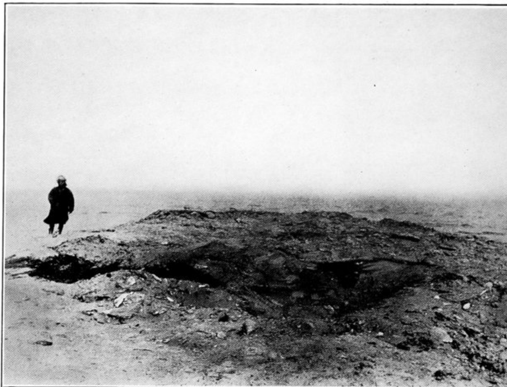
159. GRAVE PITS ON TOP OF MESA L.C. AFTER CLEARING. View obscured by effects of sand-storm.