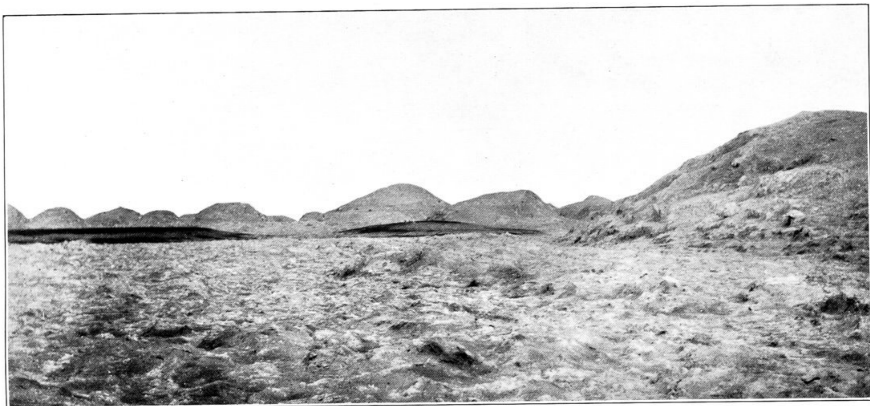
175. SALT-ENCRUSTED HILLOCKS BEYOND FIND-PLACE OF HAN COINS, ETC., BETWEEN CAMPS CI AND CII.