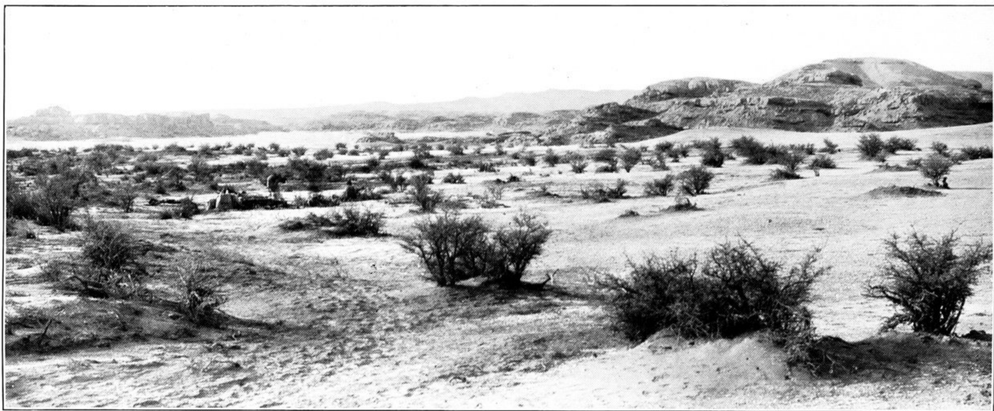
182. CAMP CVII AT FOOT OF CLAY TERRACES OVERLOOKING EASTERNMOST BAY OF DRIED-UP LOP SEA BED.