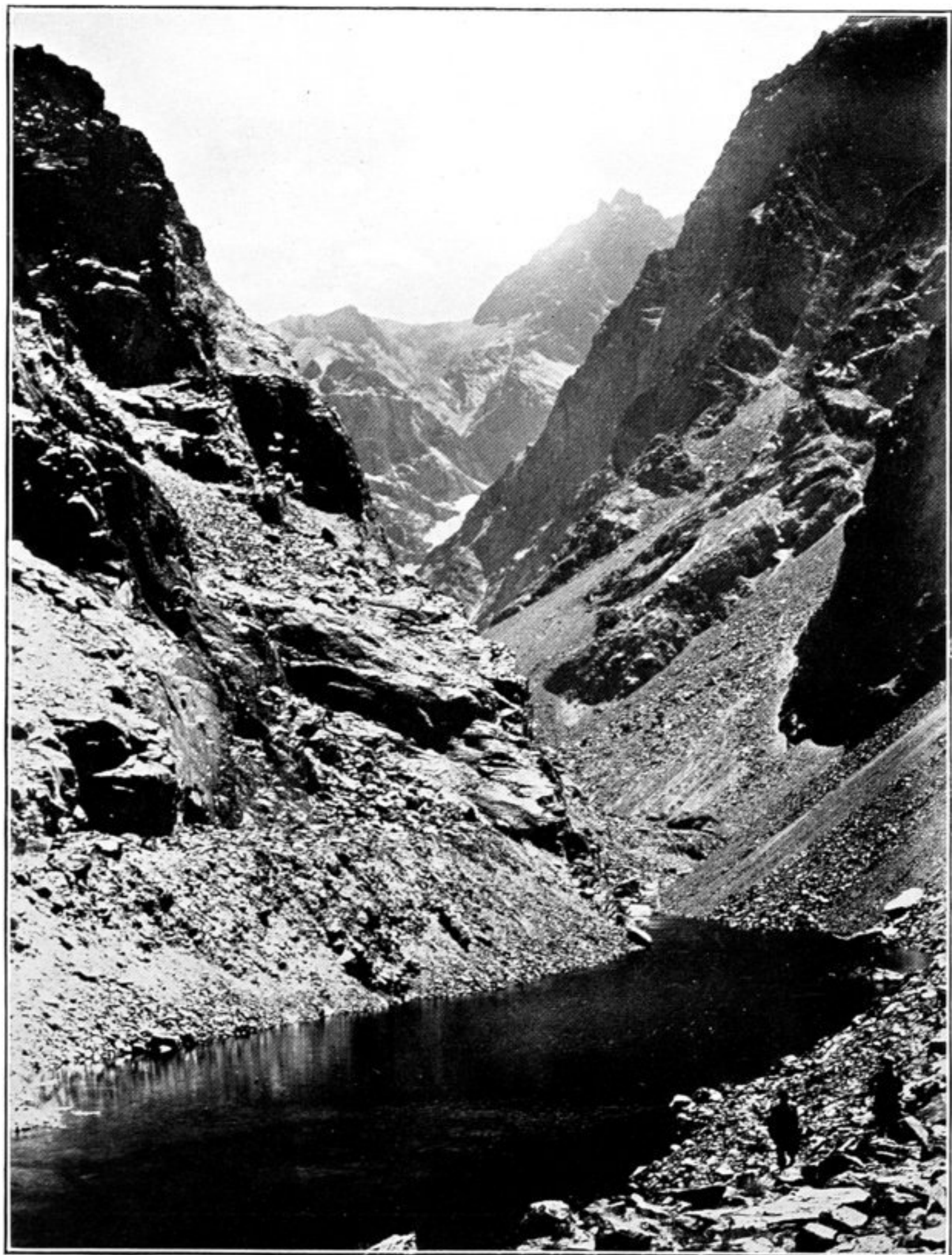
371. GORGE OF BARTANG RIVER, ABOVE RAUT, BLOCKED BY EARTHQUAKE. Newly formed tarn in foreground ; former river-bed buried under rock debris.