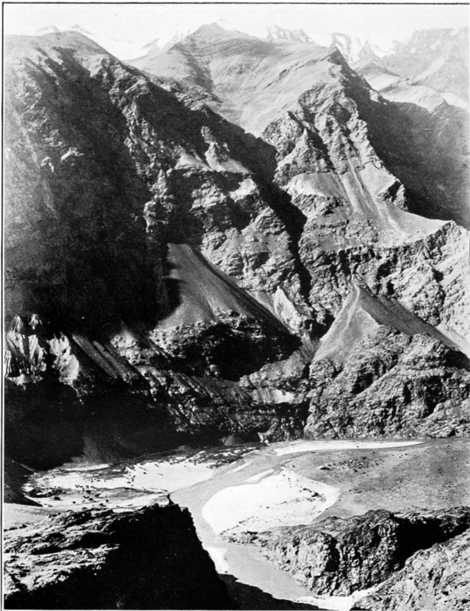
370. VIEW DOWN BARTANG GORGE NEAR NUSUR, RÖSHAN.