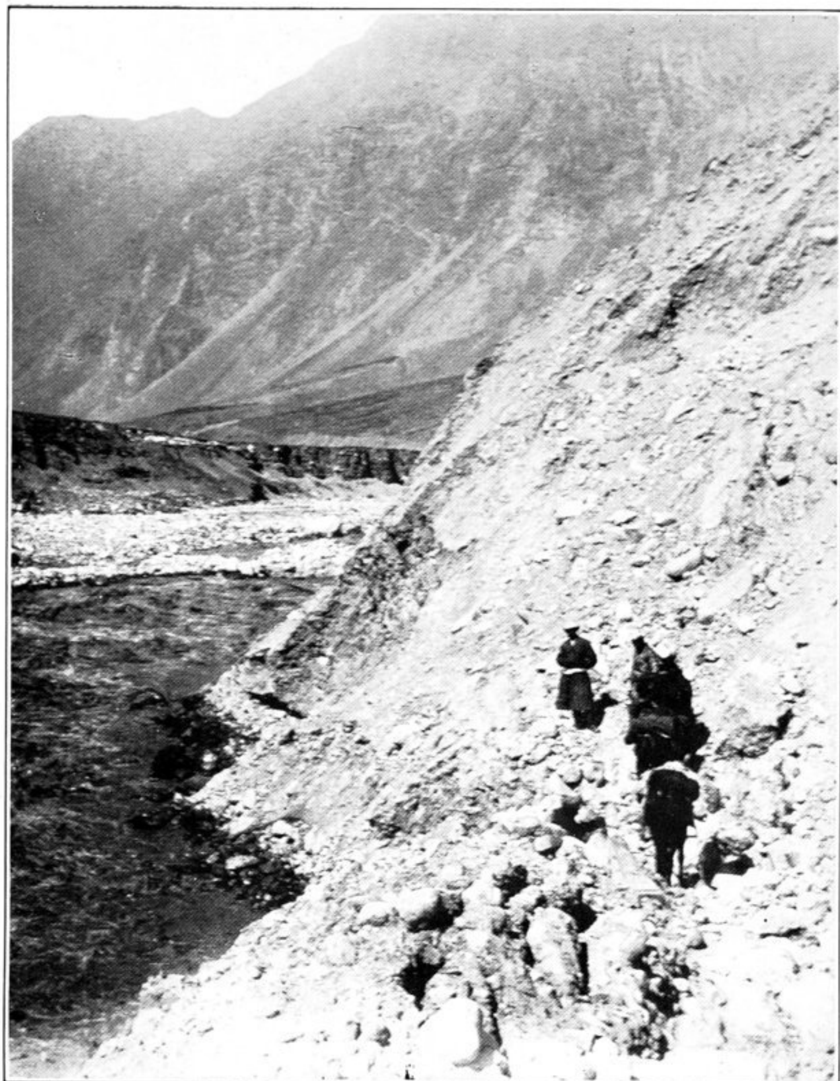
369. CROSSING ROCK DEBRIS THROWN DOWN BY EARTHQUAKE NEAR PALEZ, TANIMAZ VALLEY.