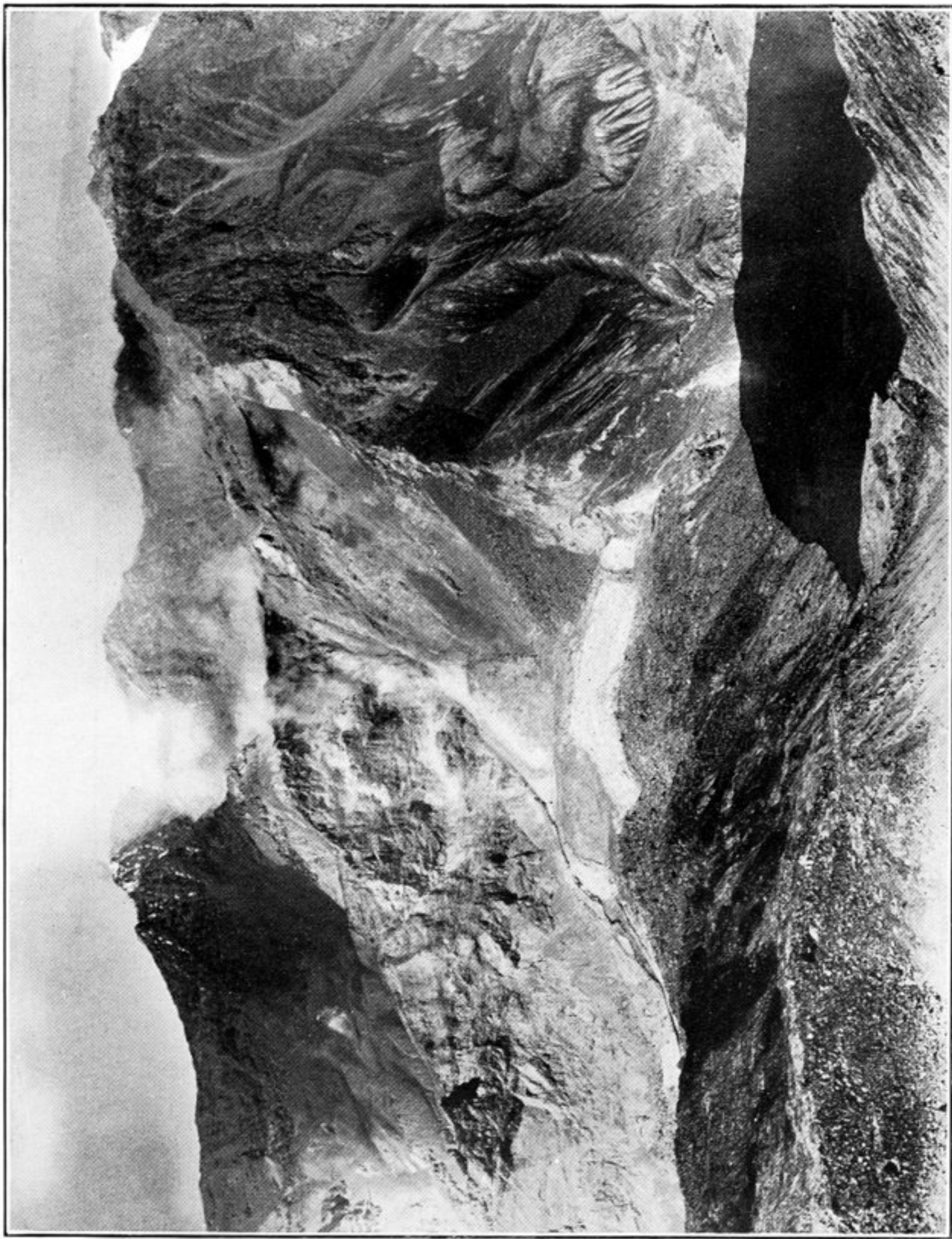
373. BARRAGE THROWN ACROSS BARTANG VALLEY BY EARTHQUAKE, WITH WESTERN END OF NEWLY FORMED SAREZ LAKE.

View from about 12,000 feet height on Marjanai spur, looking to north-west. Clouds of dust raised by rock movement on higher slopes.