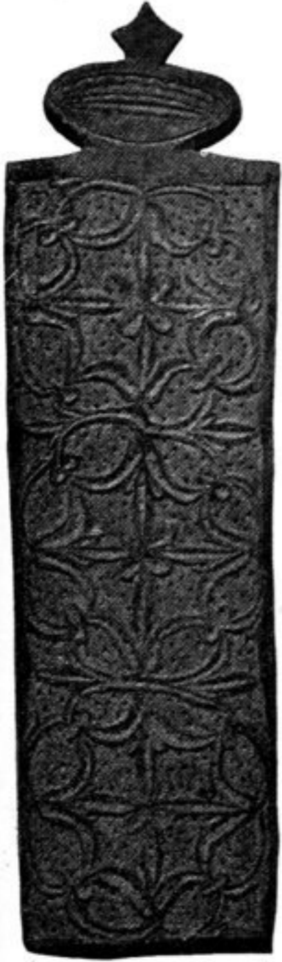
Darkōt. 01 (1/4)