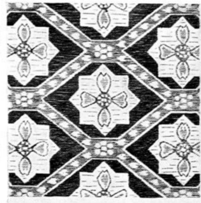
Ast. vii. I. 06 (1/4)

Pale Buff ■ Dark Buff ■ Light Blue ■ Crimson ■ Black