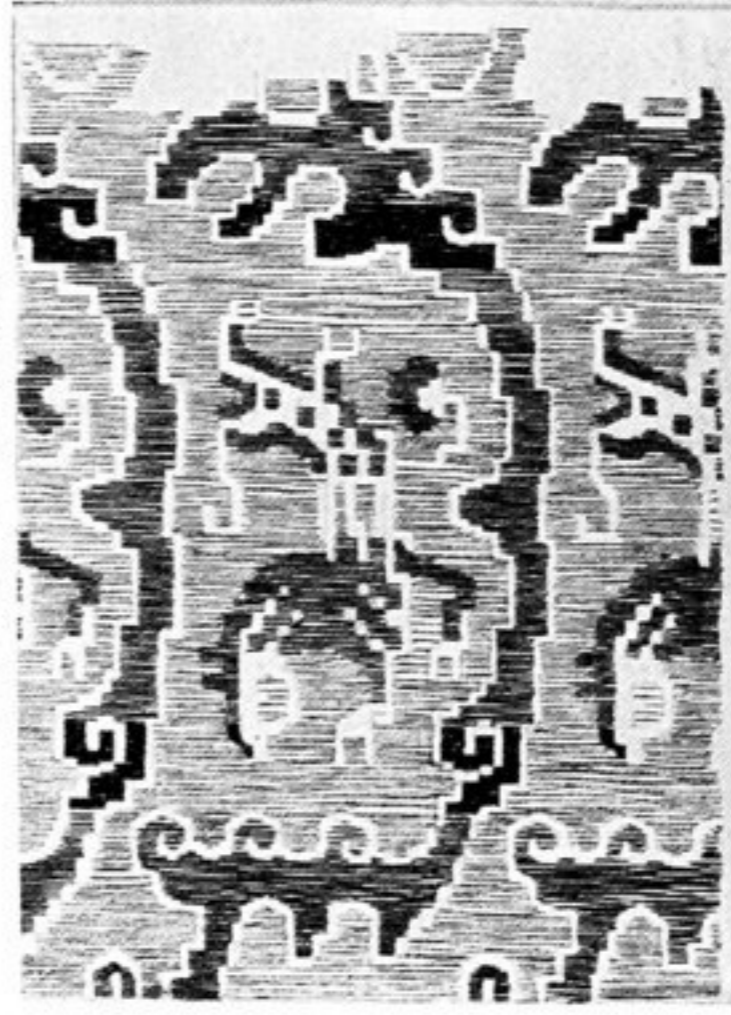
Ast. vi. I. 03 (9/16)

Pale Buff ■ Dark Buff ■ Light Blue ■ Crimson ■ Black