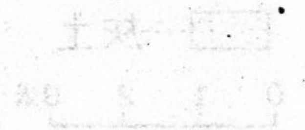
Figure 3: A scale bar with markings for 0, 5, 10, and 20 units.