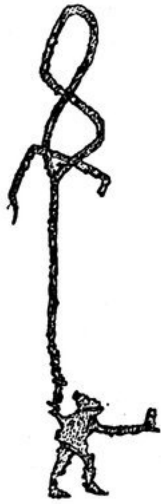
Abb. 91. - \frac{1}{4} .