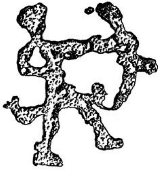
Abb. 90 b. - \frac{2}{3} .