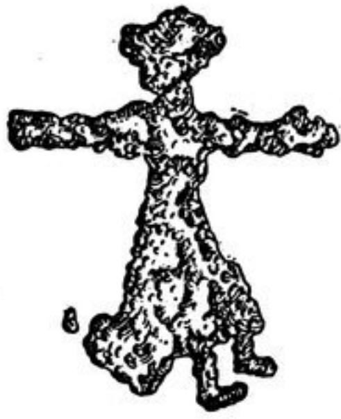
Abb. 90 a. - \frac{2}{3} .