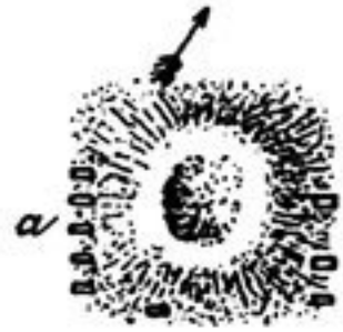
Abb. 146. Tasmin. Kurgan. a = Stein IV auf der Kartenskizze Abb. 143.