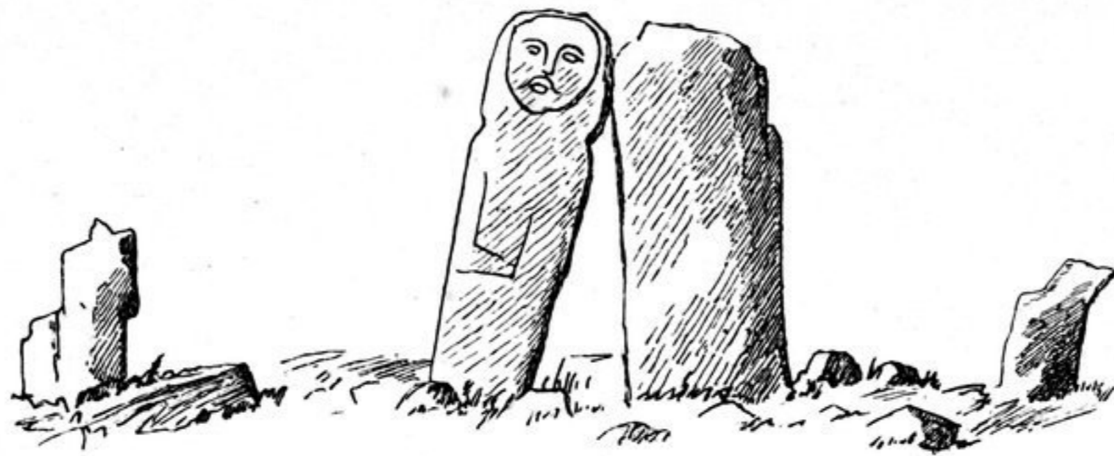
Abb. 326. Grabsteine am Ottochtachberge. Ulu-Kem.