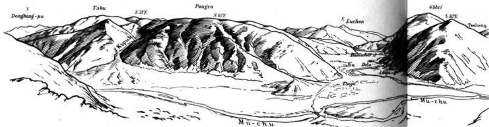
167. FROM CAMP 142, LANGMAR, APR. 13, 1907 (PL. 8).