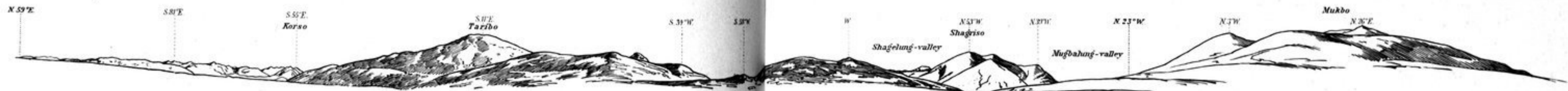
166. FROM PASS CHANG-LA-POD-LA, APR. 21, 1907 (PL. 8).