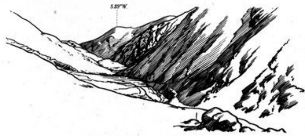
162 A. FROM THE CONFLUENCE OF KE-TSANGPO AND PASHU-TSANGPO, APR. 18, 1907 (PL. 8).