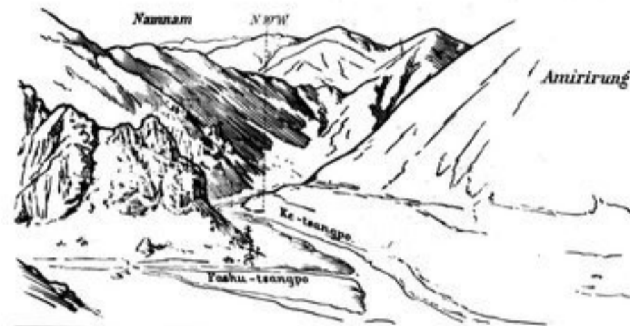
162 B. FROM THE CONFLUENCE OF KE-TSANGPO AND PASHU-TSANGPO, APR. 18, 1907 (PL. 9).