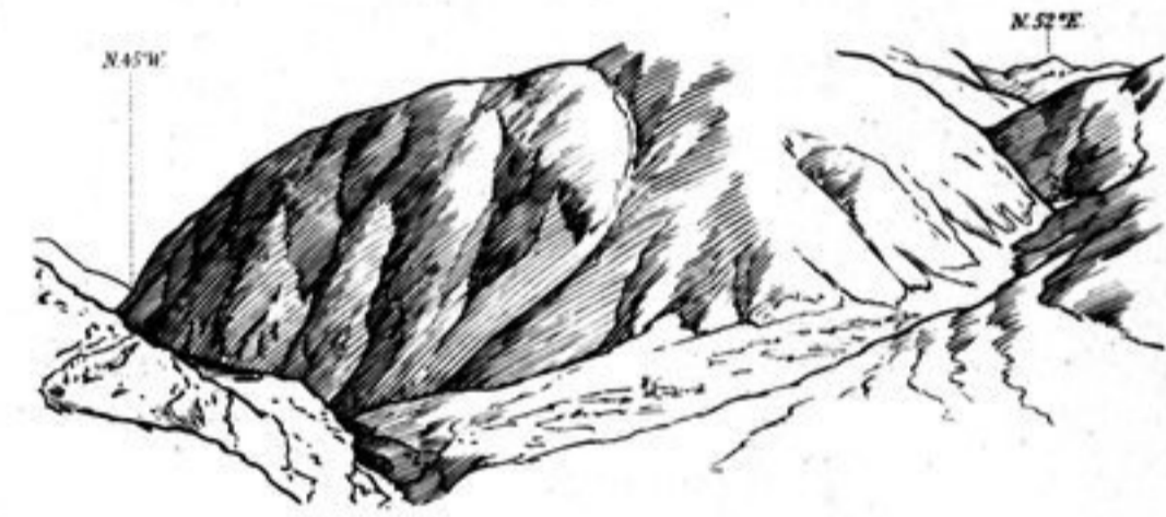
165. FROM A POINT NEAR LANGMAR, APR. 17, 1907 (PL. 8).