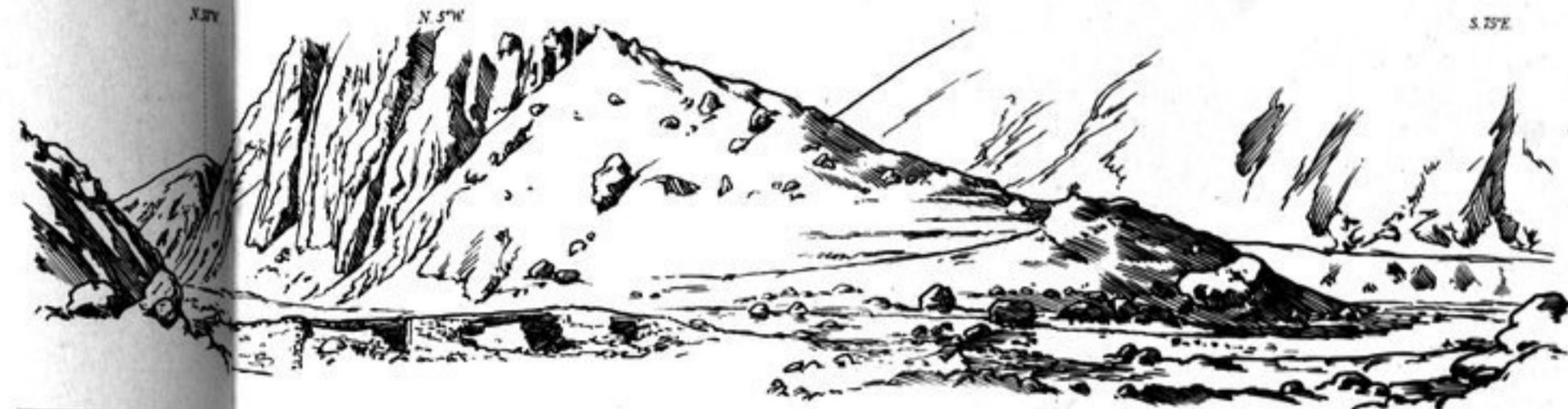
163. FROM THE OUTLET OF LENJO, APR. 13, 1907 (PL. 8).