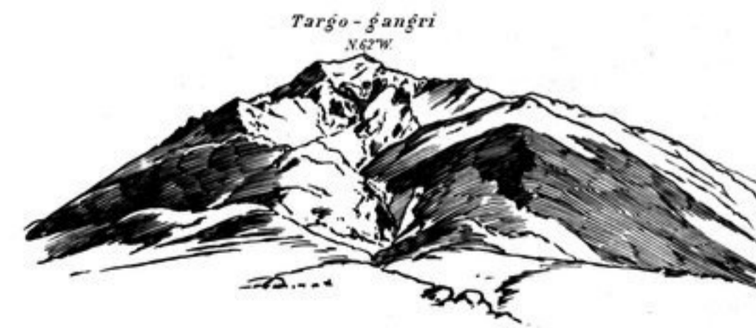
168. FROM PASS BETWEEN CAMP 150 AND CAMP 151, APR. 30, 1907 (PL. 9).