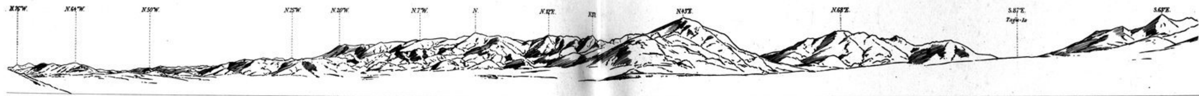
241. FROM CAMP 186, TAMBAP, JUNE 26, 1907 (PL. 11)