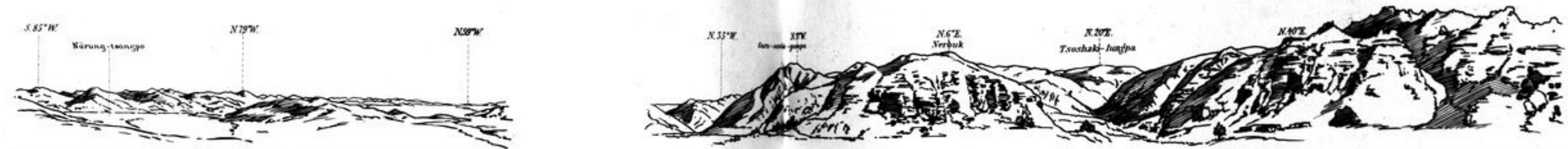
242. NEAR CAMP 186, TAMBAP, JUNE 26, 1907 (PL. 11)