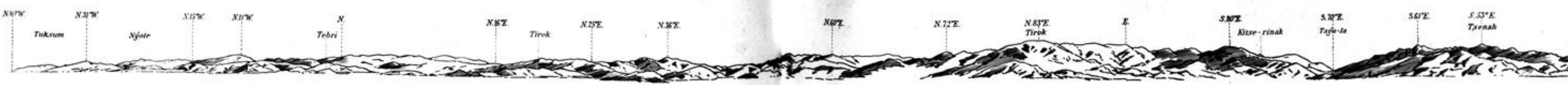
246 A. FROM CAMP 187, NAGOR, JUNE 27, 1907 (PL. 11)