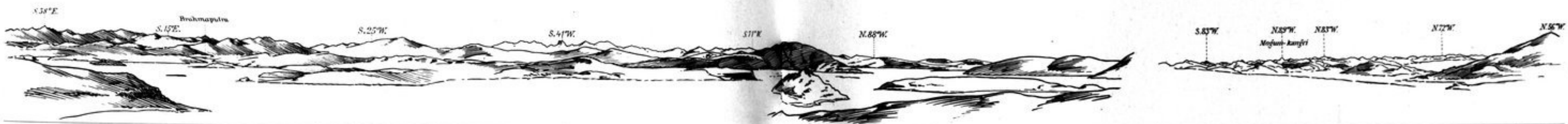
244. FROM A POINT NEAR CAMP 189, DONGRO, JUNE 29, 1907 (PL. 11)