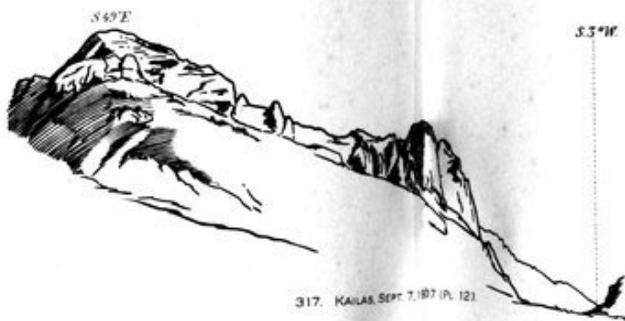
317. KAILAS SEPT. 7, 1907 (PL. 12).