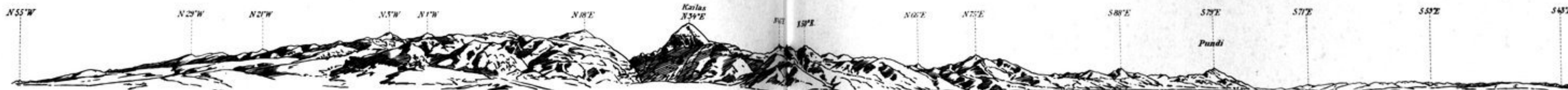
315 A. FROM CAMP 230, KHALEB, SEPT. 1907 (PL. 12).