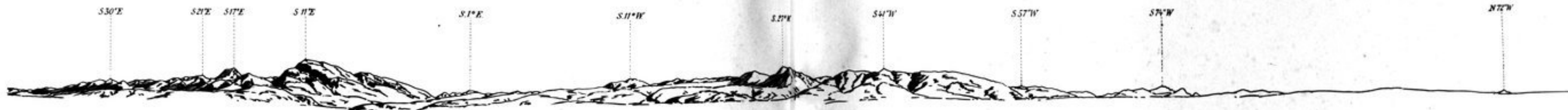
315 B. FROM CAMP 230, KHALEB, SEPT. 1907 (PL. 12).