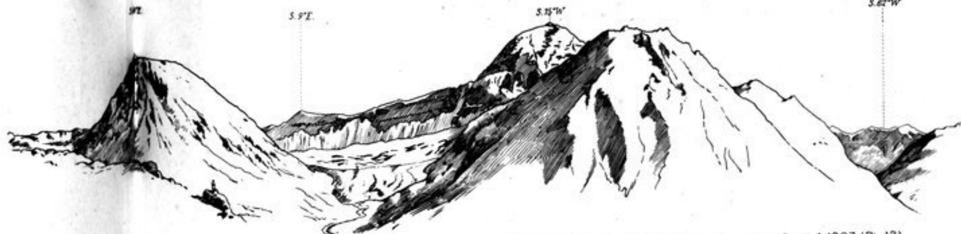
320. KAILAS FROM A THRESHOLD N. N. E. OF THE TOP, SEPT. 4, 1907 (PL. 12).