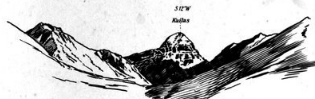
314. FROM TSETI-VALLEY, SEPT. 8, 1907 (PL. 12).