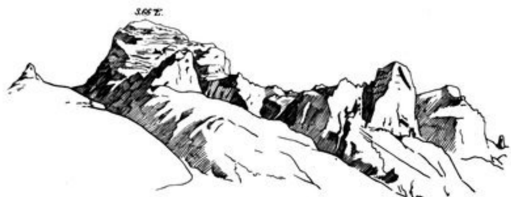
319. KAILAS FROM THE VALLEY N 66° W OF THE TOP, SEPT. 3, 1907 (PL. 12).