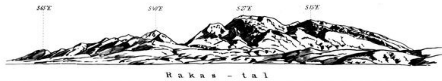
312. GURLA-MANDATA FROM LAGHE-TO, AUG. 29, 1907 (PL. 12).