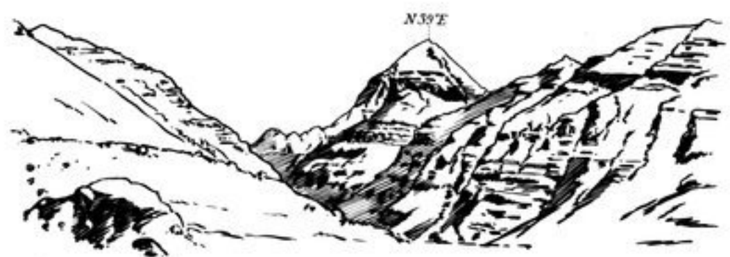
316. KAILAS, SEPT. 3, 1907 (PL. 12).