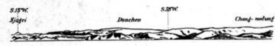
341 A. FROM CAMP 243, LUMA-RIGMO. SEPT. 18. 1907 (PL. 13).