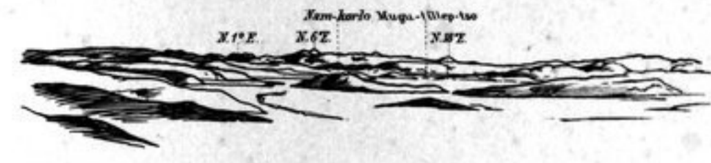
336. FROM PASS TSALAM-NGOPTA-LA. SEPT. 13 1907 (PL. 12).