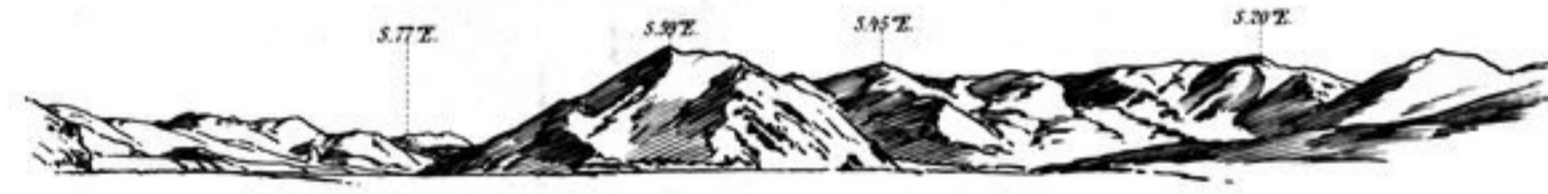
342. FROM CAMP 245, SAMBUK-SUMDO. SEPT. 20. 1907 (PL. 13).