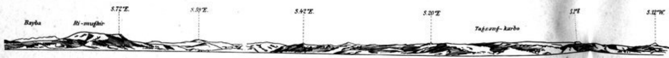
341 C. FROM CAMP 243, LUMA-RIGMO. SEPT. 18. 1907 (PL. 13).