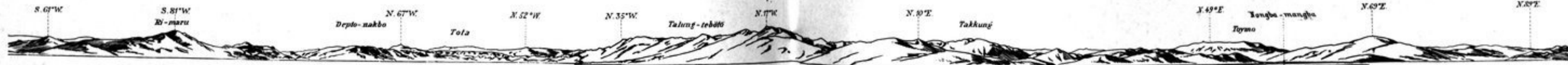
341 B. FROM CAMP 243, LUMA-RIGMO. SEPT. 18. 1907 (PL. 13).