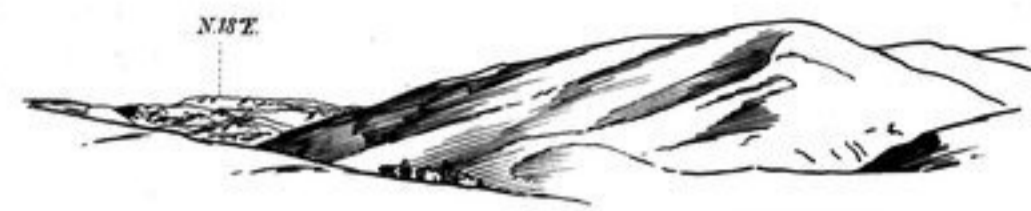
334. FROM A THRESHOLD 5 KM N. 70° E. OF CAMP 238. SEPT. 13 1907 (PL. 12).