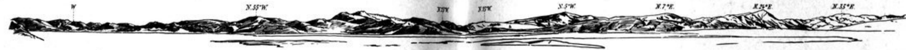
339. FROM CAMP 240, SEPT. 14. 1907 (PL. 13).