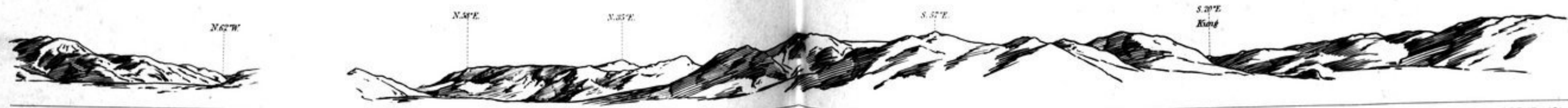
343. FROM CAMP 245, SAMBUK-SUMDO. SEPT. 20. 1907 (PL. 13).