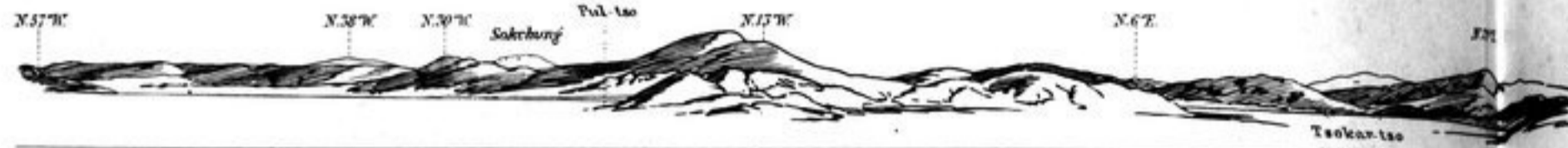
337. FROM A POINT BETWEEN CAMP 242 AND CAMP 243. SEPT. 18 1907 (PL. 13).