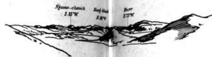
335. FROM A POINT BETWEEN DAM-KARCHEN AND TSALAM-NGOPTA-LA. SEPT. 13 1907 (PL. 12).