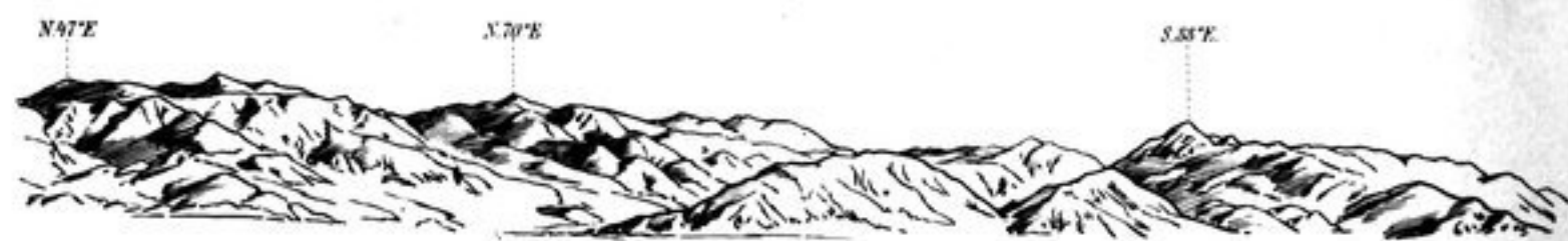
363. FROM CAMP 263, DUNG-KANG, NOV. 19, 1907 (PL. 14)