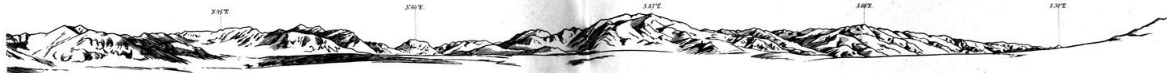
359 B. FROM CAMP 257, THE CONFLUENCE OF GARTANG AND INDUS, NOV. 11-12, 1907 (PL. 14)