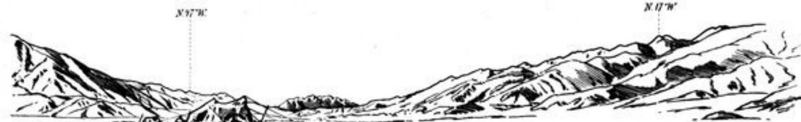
364. FROM CAMP 263, DUNG-KANG, NOV. 19, 1907 (PL. 14)