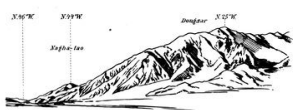
360 B. FROM CAMP 258, TASHI-GANG, NOV. 13-14, 1907 (PL. 14)