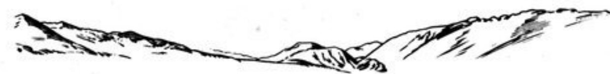
362. FROM CAMP 260, DEMCHOK, UPWARDS, NOV. 16, 1907 (PL. 14)