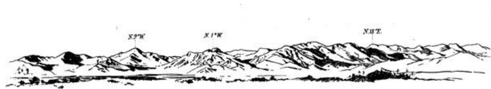
358. FROM CAMP 256, LANGMAR, NOV. 10, 1907 (PL. 14)