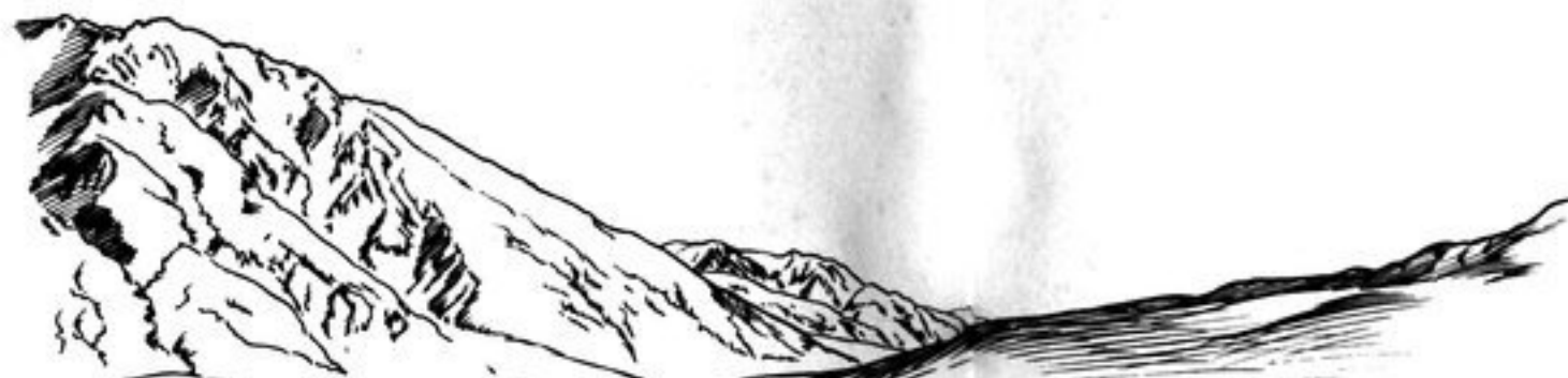
361. FROM CAMP 259, DEMCHOK, DOWNWARDS, NOV. 16, 1907 (PL. 14)