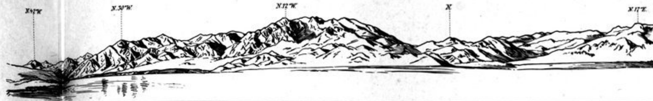
359 A. FROM CAMP 257, THE CONFLUENCE OF GARTANG AND INDUS, NOV. 11-12, 1907 (PL. 14)