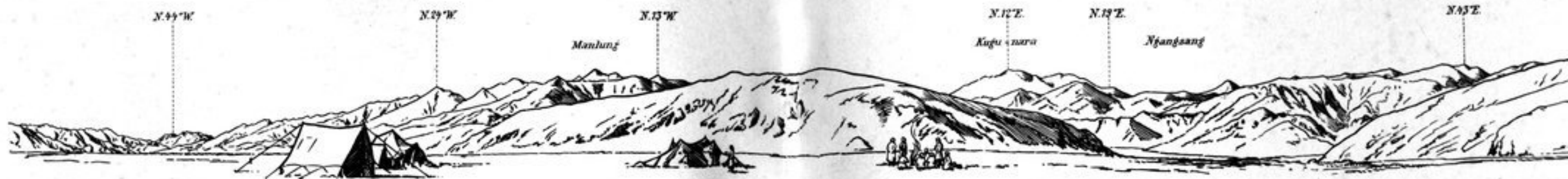
367 A. FROM CAMP 262, PUKTSE, NOV. 16, 1907, (PL. 14)