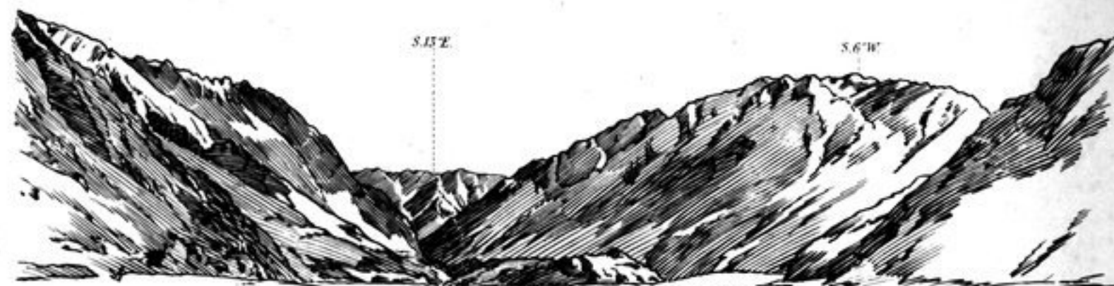
370. FROM CAMP 276, YULGHUNLUK, DEC. 11-12, 1907, (PL. 15)