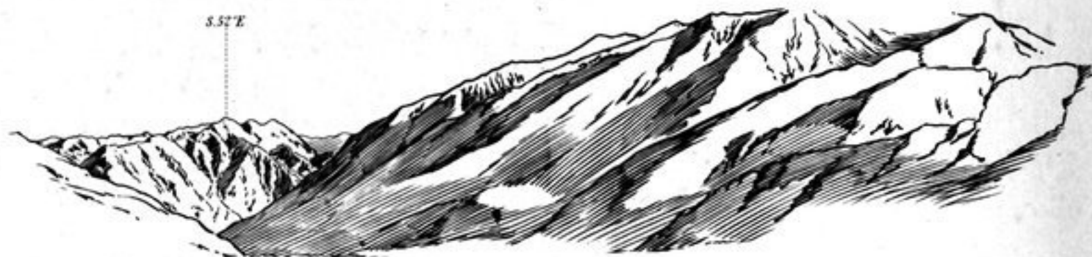
365. FROM CAMP 275, CHARVAGH, DEC. 10, 1907, (PL. 15)