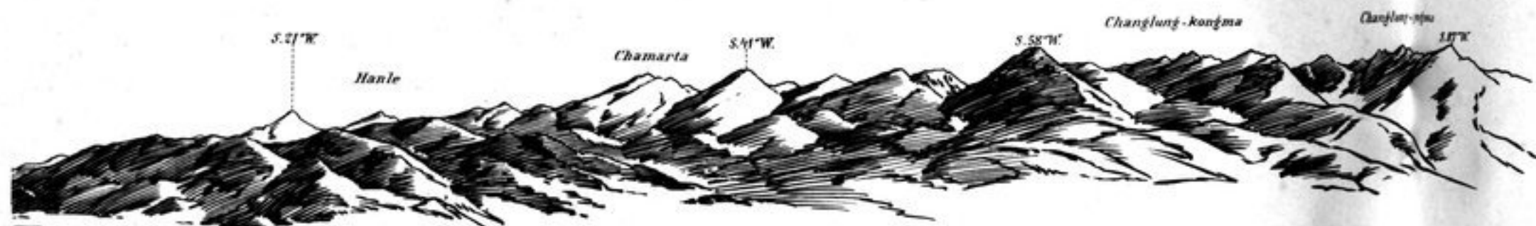
367 C. FROM CAMP 262, PUKTSE, NOV. 18, 1907, (PL. 14)