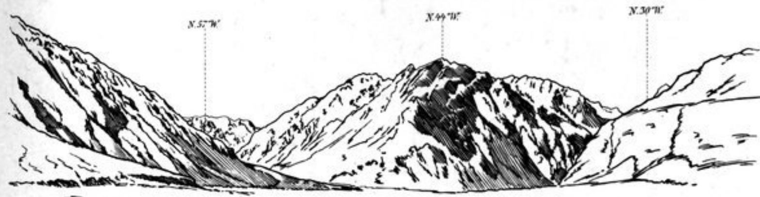
369. FROM CAMP 276, YULGHUNLUK, DEC. 11-12, 1907, (PL. 15)