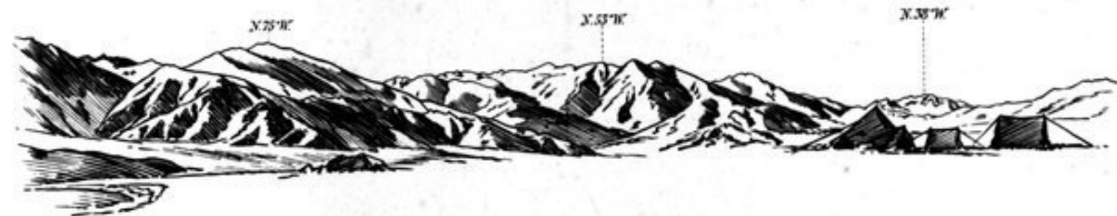
368. FROM CAMP 264, LUNG-KUNG, NOV. 20, 1907, (PL. 14)