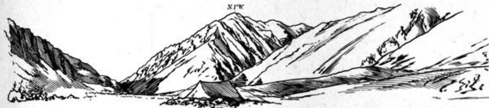
366. FROM CAMP 275, CHARVAGH, DEC. 10, 1907, (PL. 15)