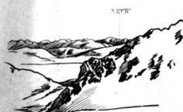
495. FROM CAMP 408, DAKSHA-LUNGPA, MAY 17, 1908, (PL. 21).