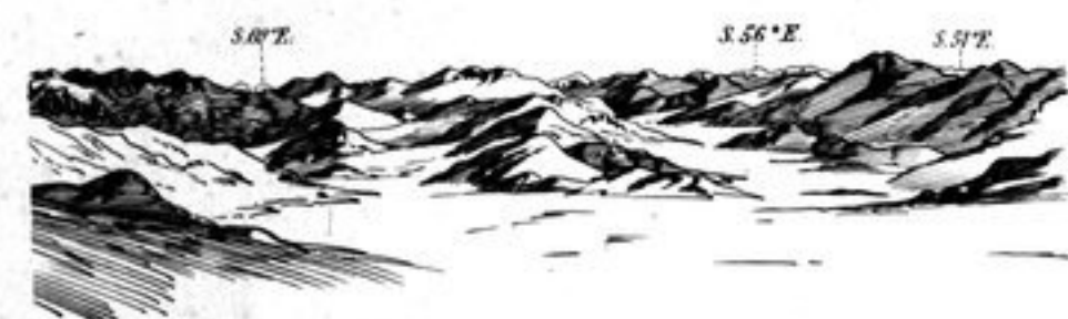
496 C. FROM PANG-SHACHEN, NEAR CAMP 410, HLAKELUNG, MAY 19, 1908, (PL. 12).