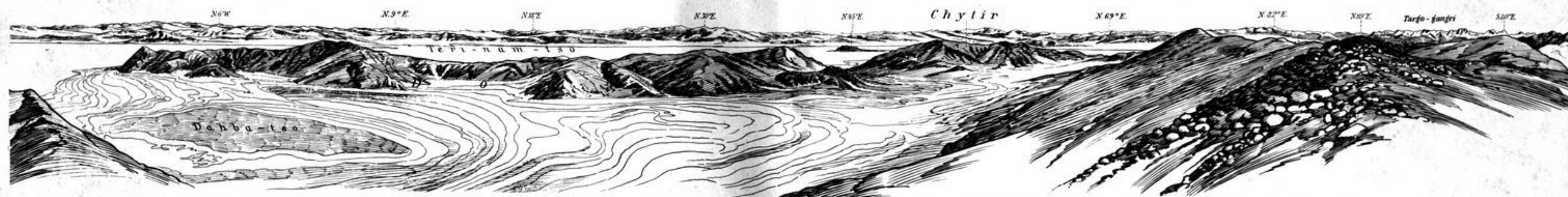
496 B. FROM PANG-SHACHEN, NEAR CAMP 410, HLAKELUNG, MAY 19, 1908 (PL. 21).