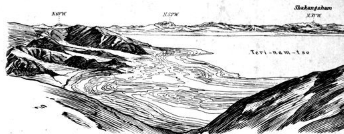
496 A. FROM PANG-SHACHEN, NEAR CAMP 410, HLAKELUNG, MAY 19, 1908, (PL. 21).