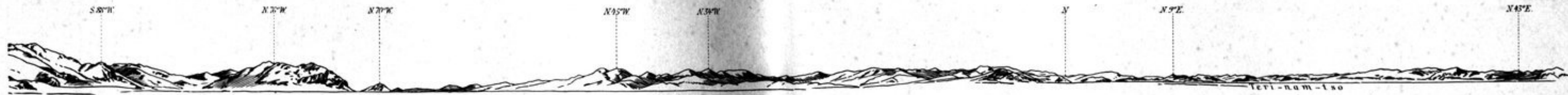
500 C. FROM CAMP 412, TERTSI, MAY 25, 1908 (PL. 21).