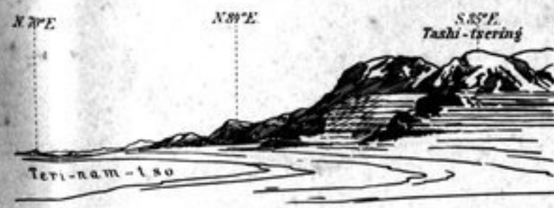
499. FROM CAMP 411, KIBUK-HLE, MAY 24, 1908 (PL. 21).