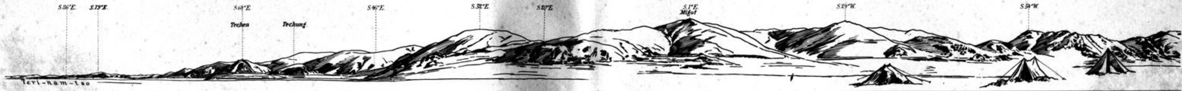
500 B. FROM CAMP 412, TERTSI, MAY 25, 1908 (PL. 21).