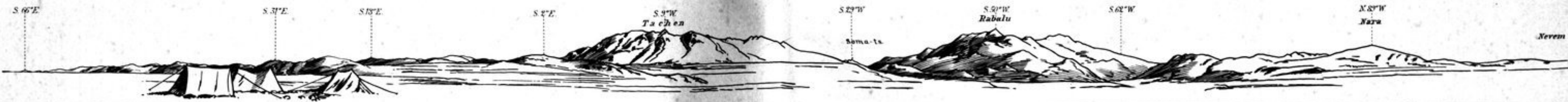
501 A. FROM CAMP 413, MENDONG-GOMPA, MAY 26-27, 1908, (PL. 21).