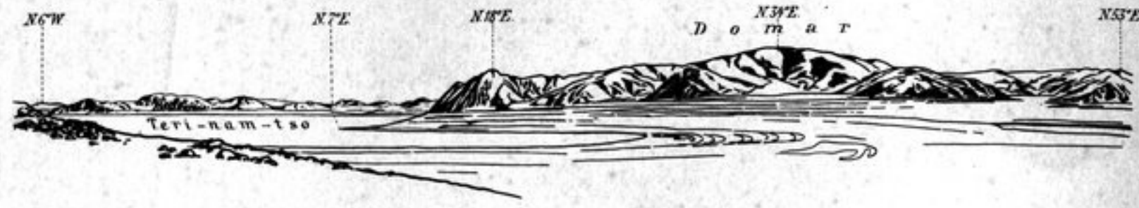
498. FROM CAMP 410, HLAKUNG, MAY 19, 1908, (PL. 21).