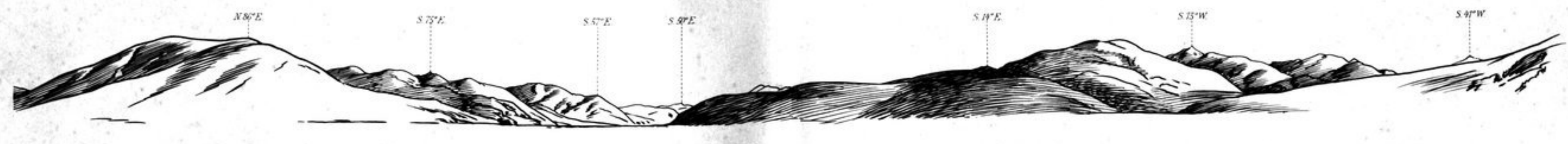
508 B. FROM CAMP 418, SAGLAM-HLUNOPA, JUNE 2, 1908 (PL. 22).