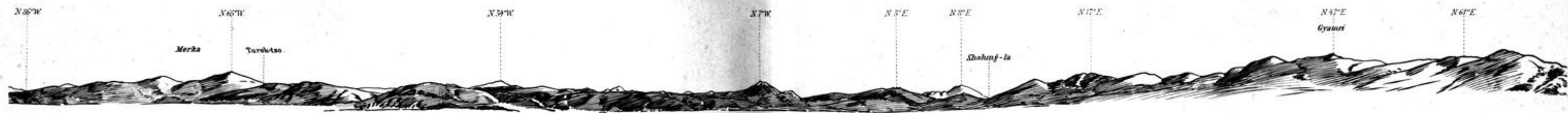
507 B. FROM CAMP 419, GOLE-TATA, JUNE 3, 1908 (PL. 22).