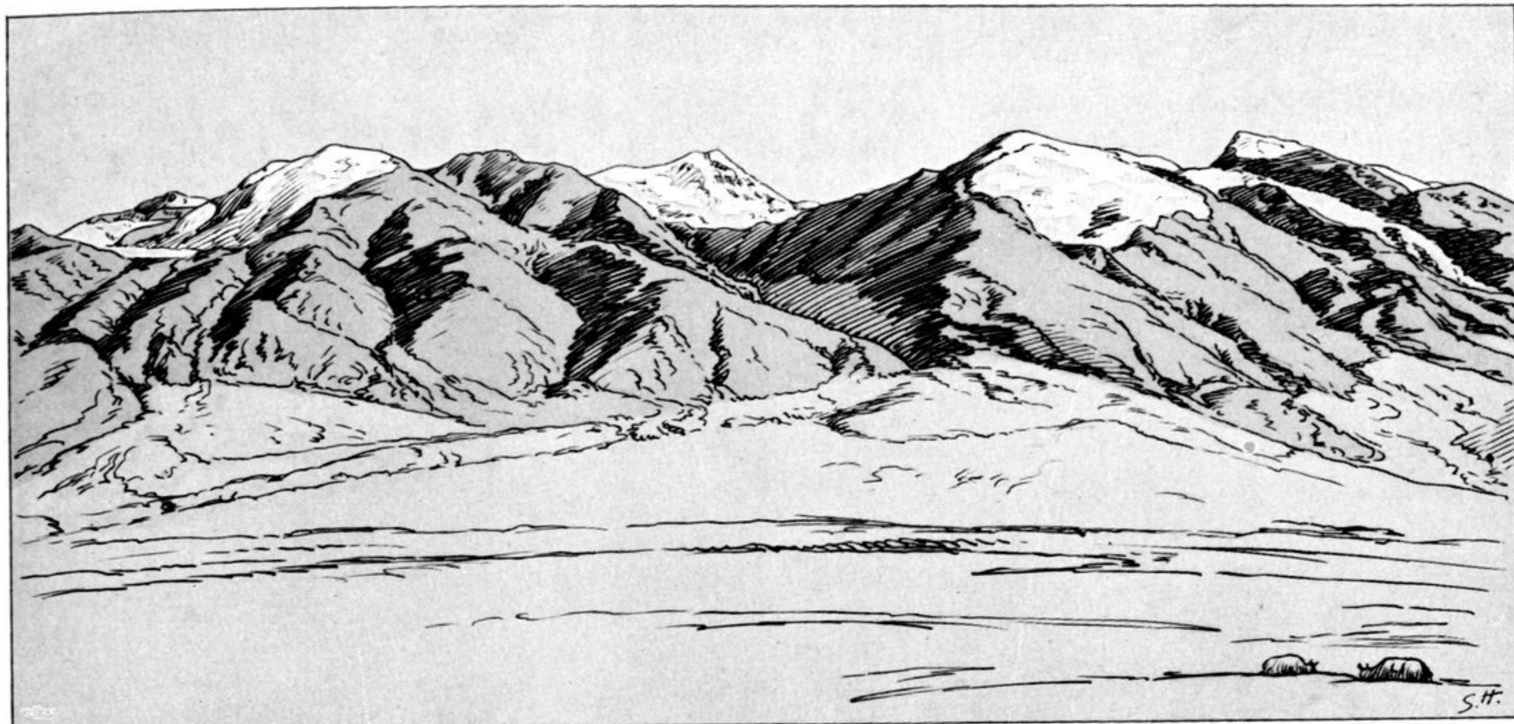
THE GURLA-MANDATA FROM CAMP 218, SOUTHERN SHORE OF MANASAROVAR.