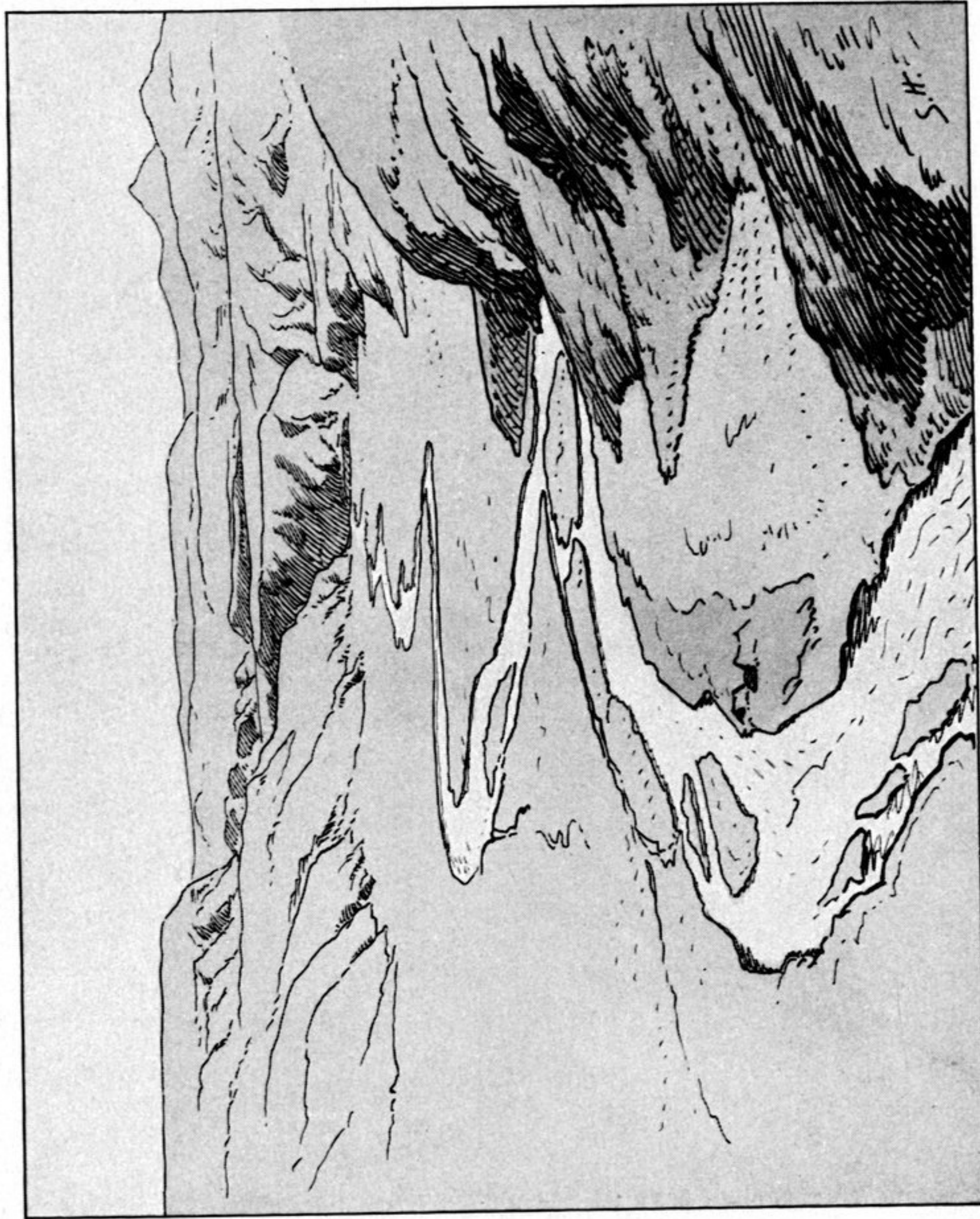
THE RABGYÁLING VALLEY, A TRIBUTARY TO THE UPPER SATLEJ, LOOKING S.S.W.