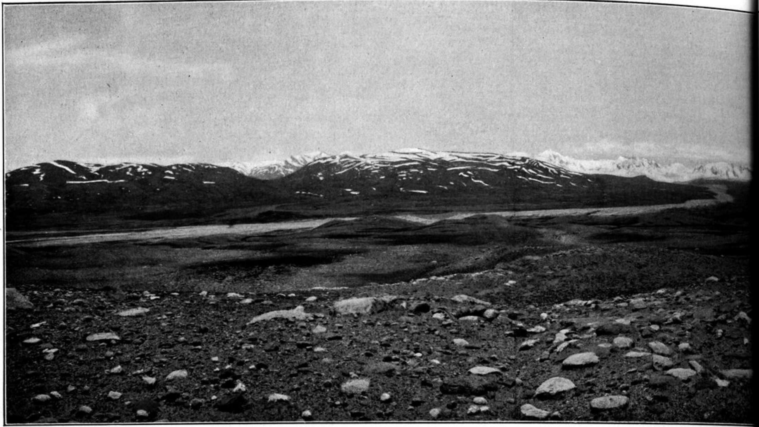
THE KUBI-GANGRI AND THE KUBI