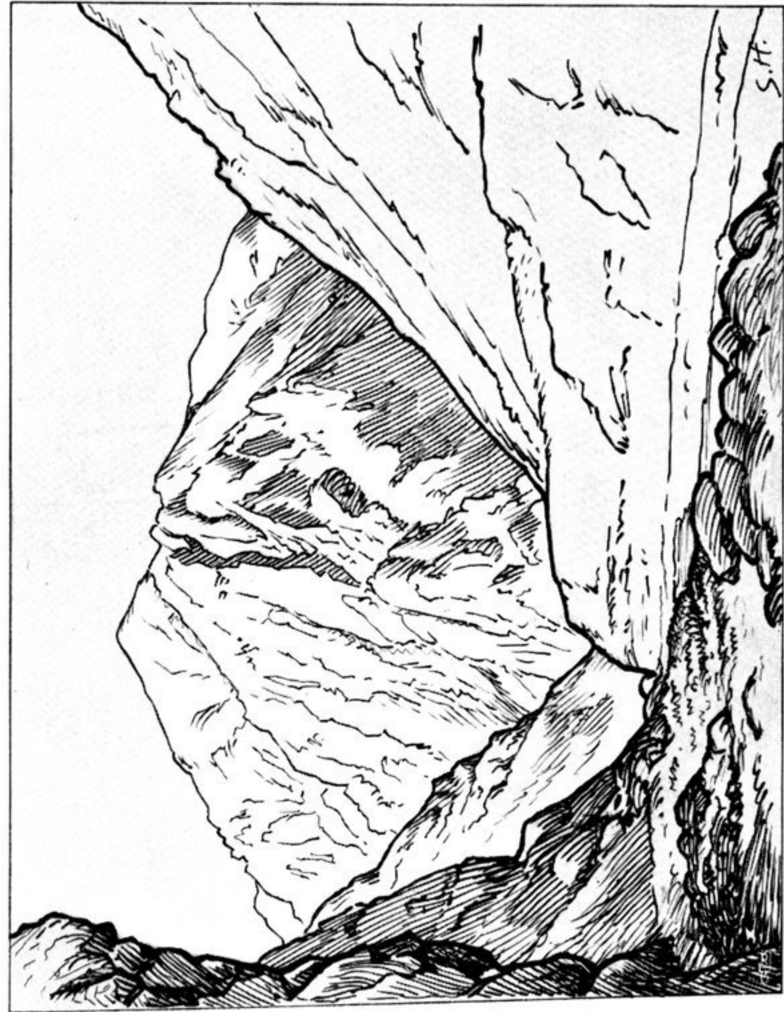
THE SAME, HIGHER UP THE VALLEY.