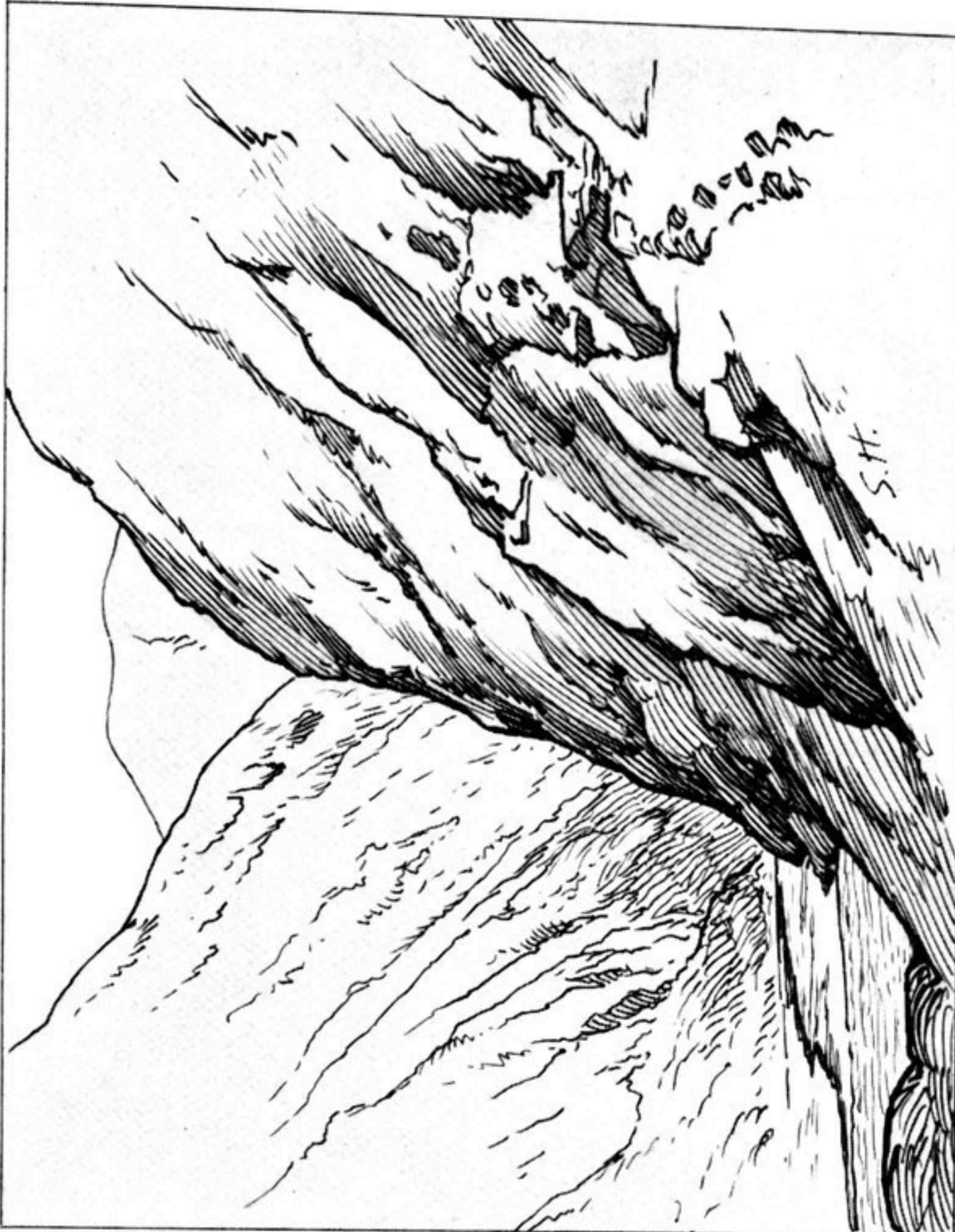
TIGU-TANG (APRIL 13).