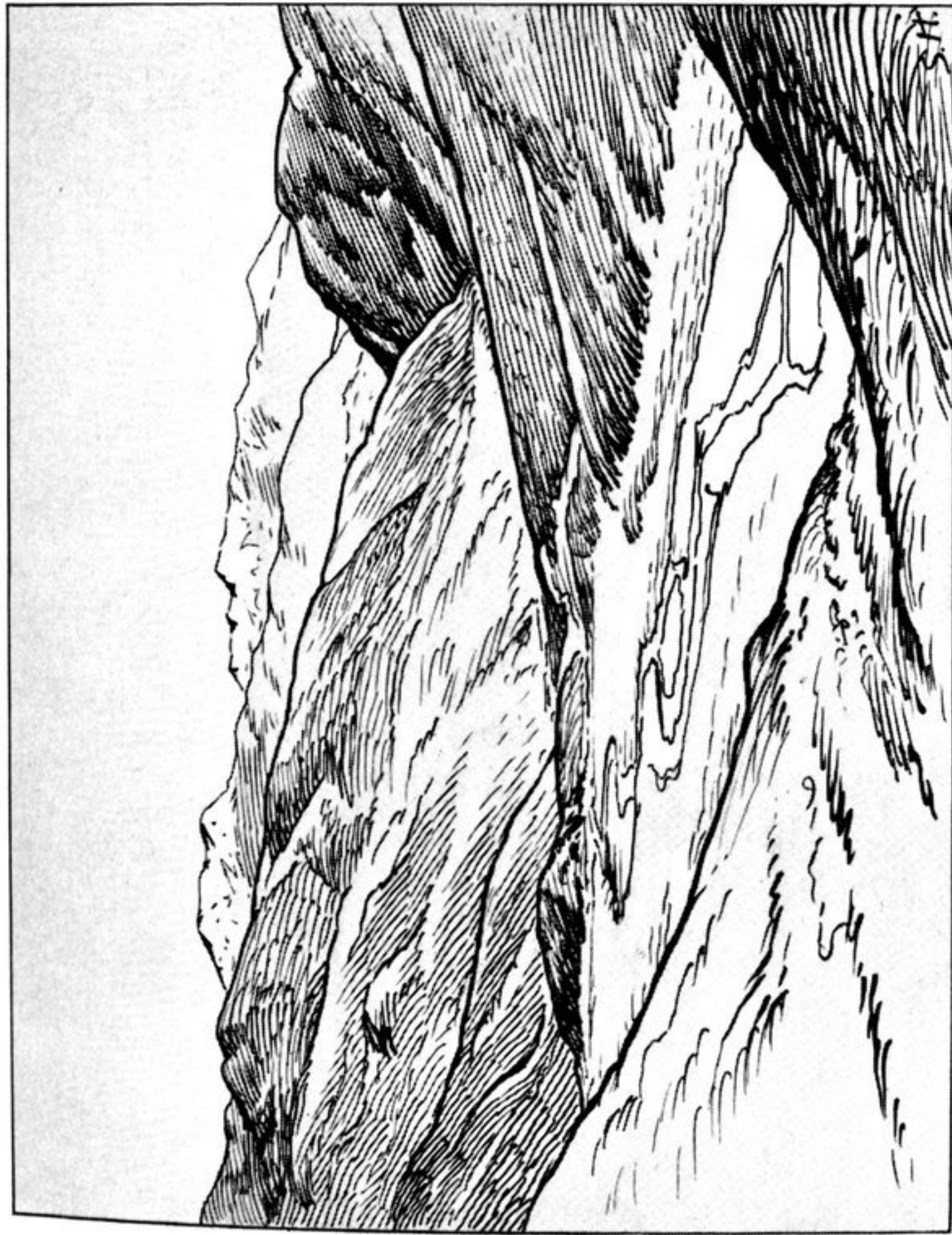
LOOKING UP THE RIVER FROM A POINT BELOW LEHLUNG (APRIL 12).