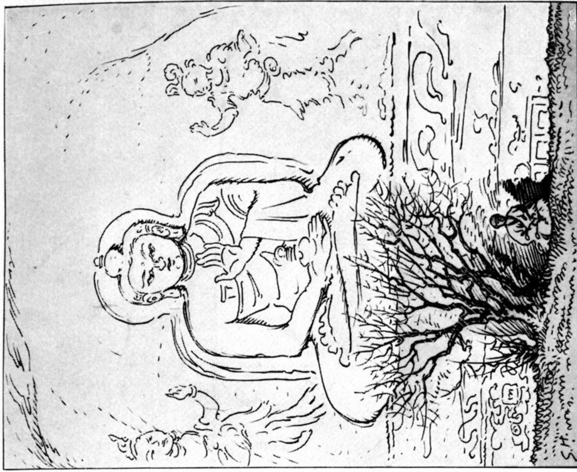
A BUDDHA-SCULPTURE IN GRANITE AT LINGÖ (APRIL 7).