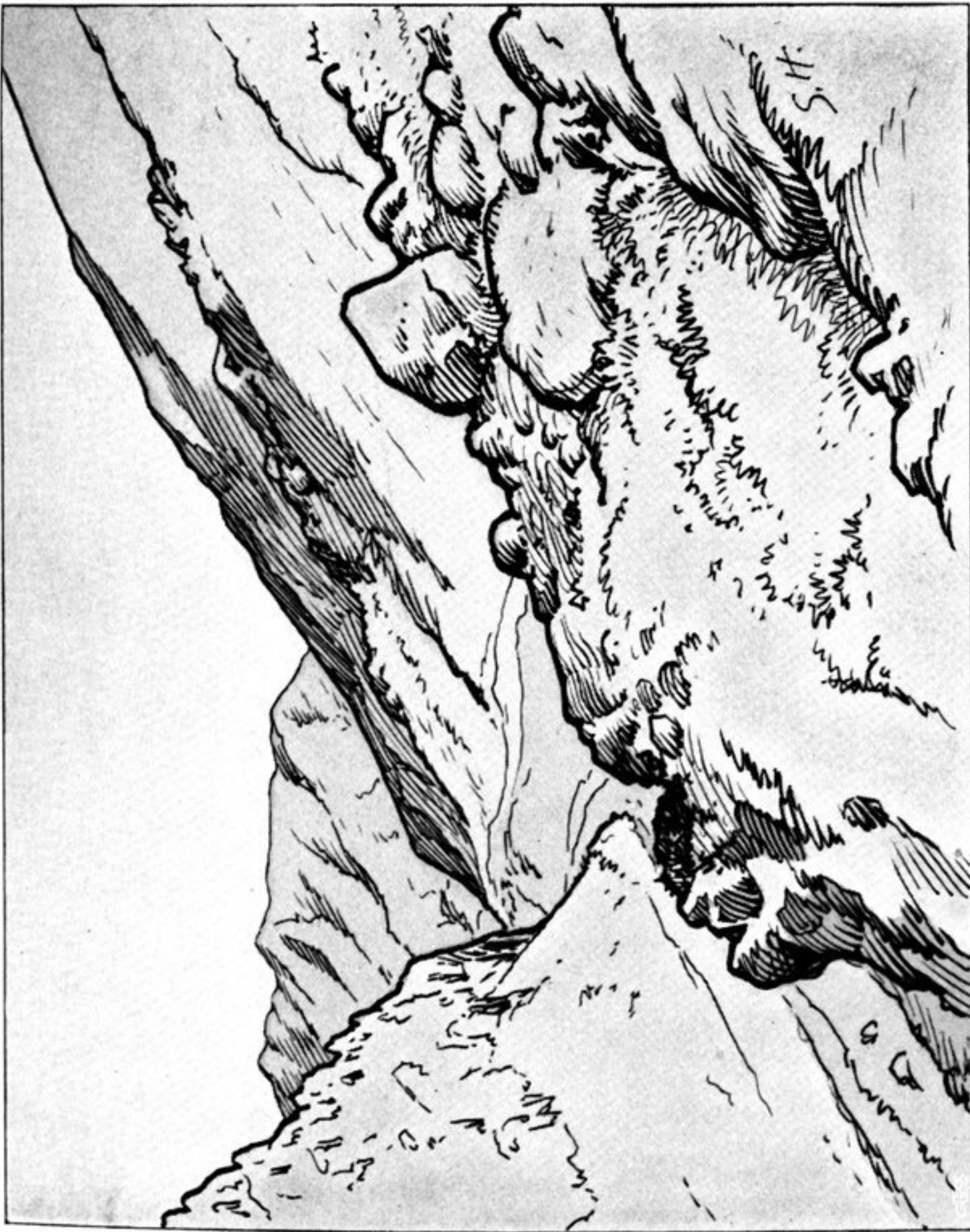
LOOKING DOWN THE VALLEY FROM CHOGE LUNG (APRIL 18).