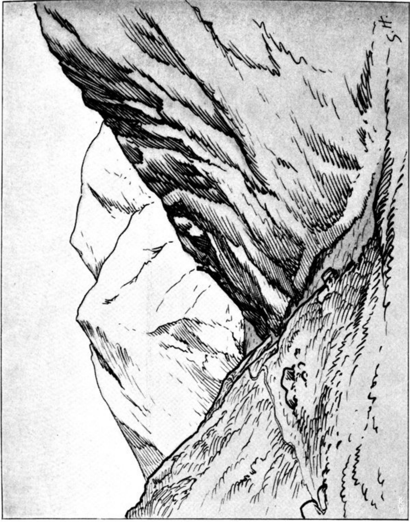
LOOKING UP THE VALLEY FROM CHOGE LUNG.