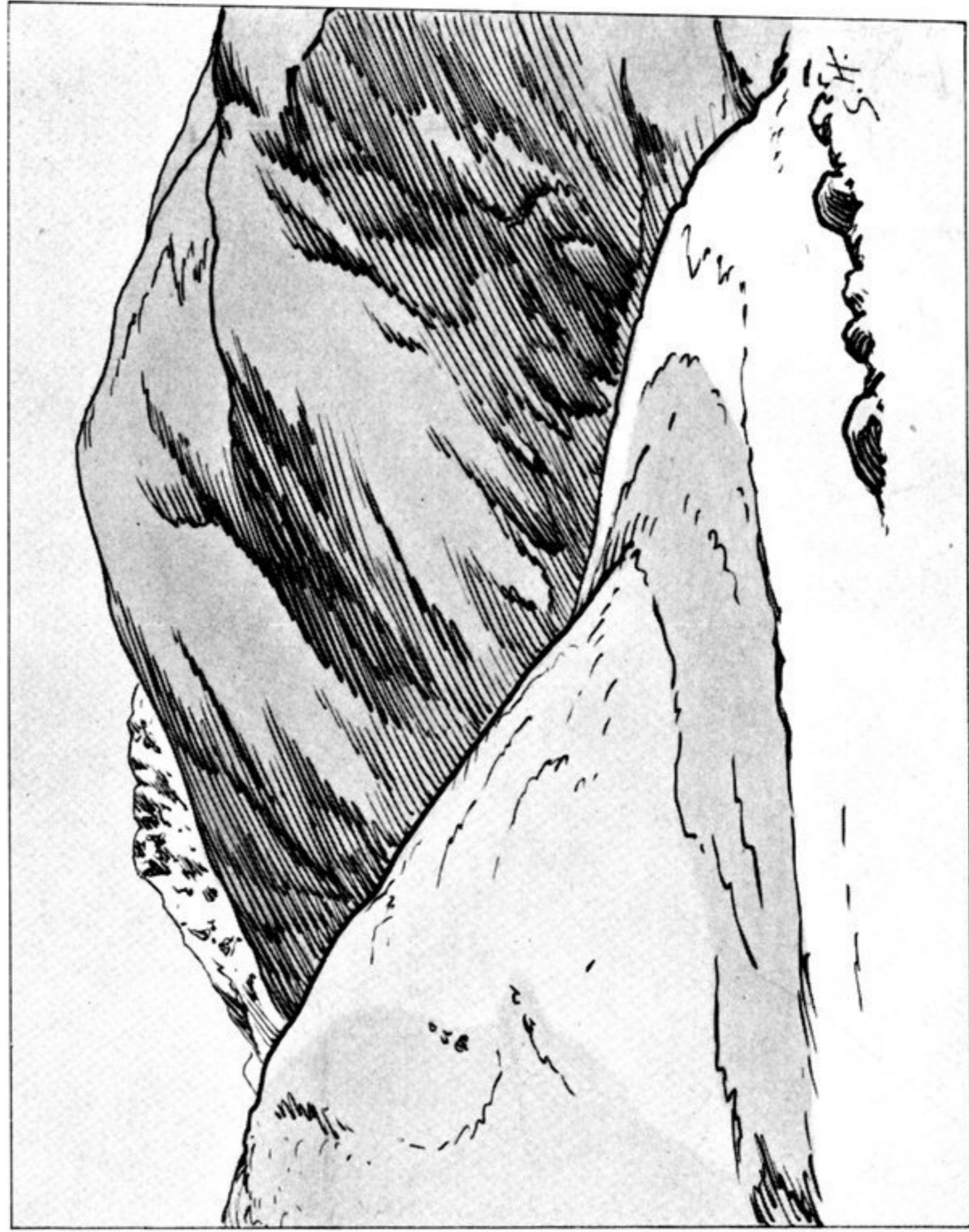
THE VALLEY PORTSUK AS SEEN FROM GOVO.