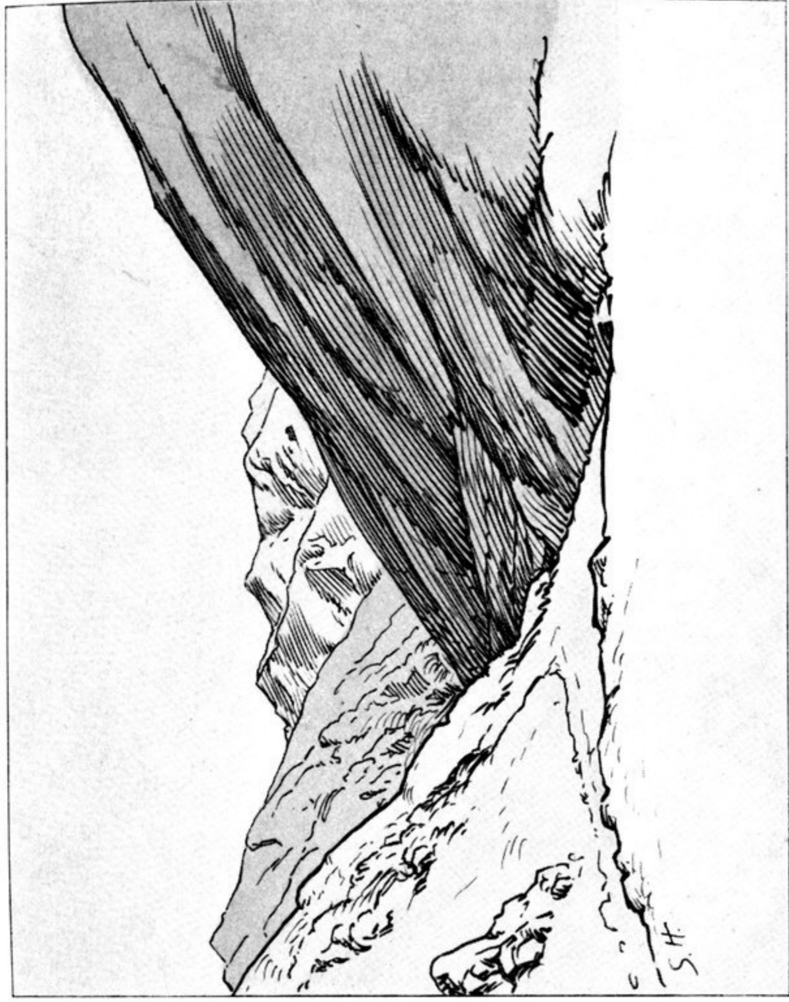
LOOKING DOWN THE VALLEY FROM GOVO.