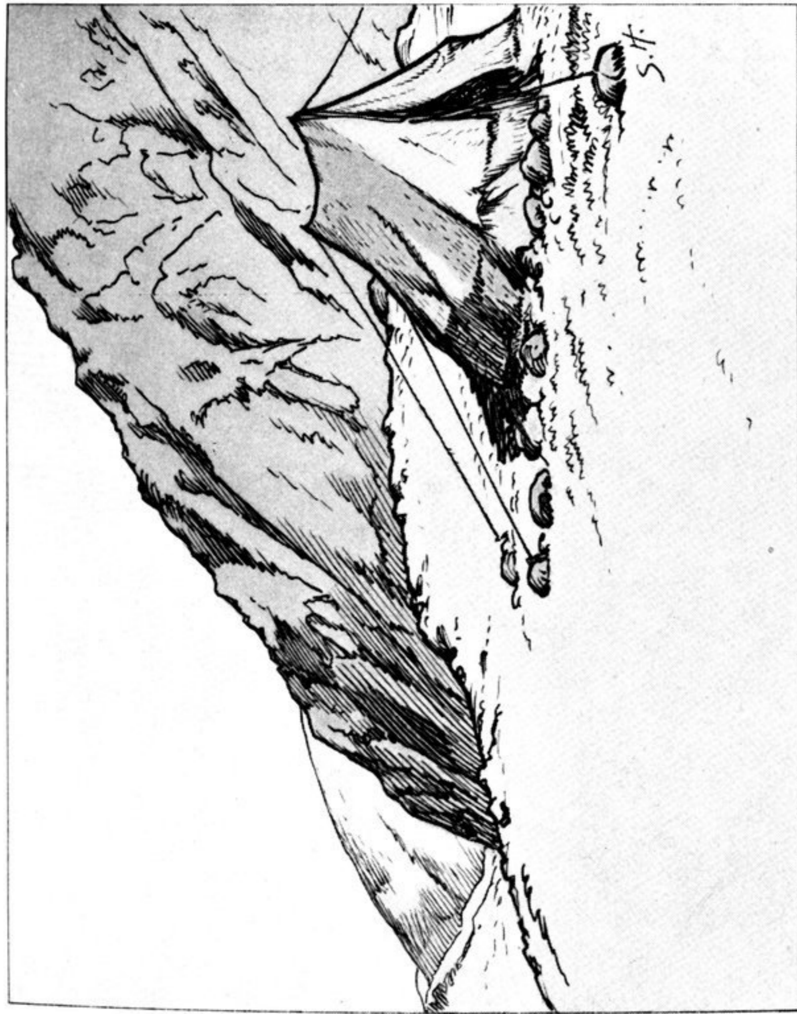
LOOKING UP THE VALLEY FROM GOVO.