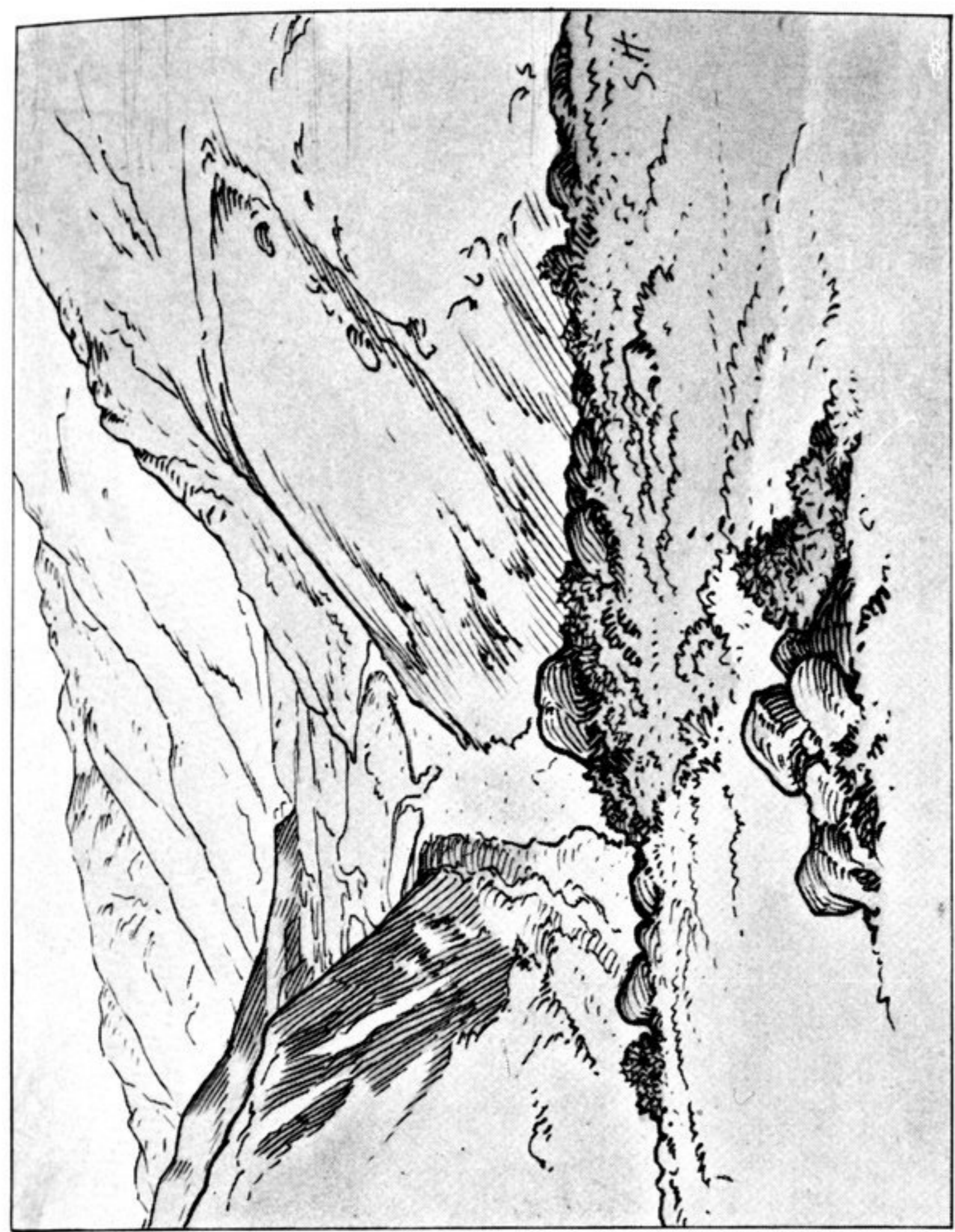
LOOKING UP THE VALLEY FROM THE MOUTH OF TALUNG (APRIL 20).