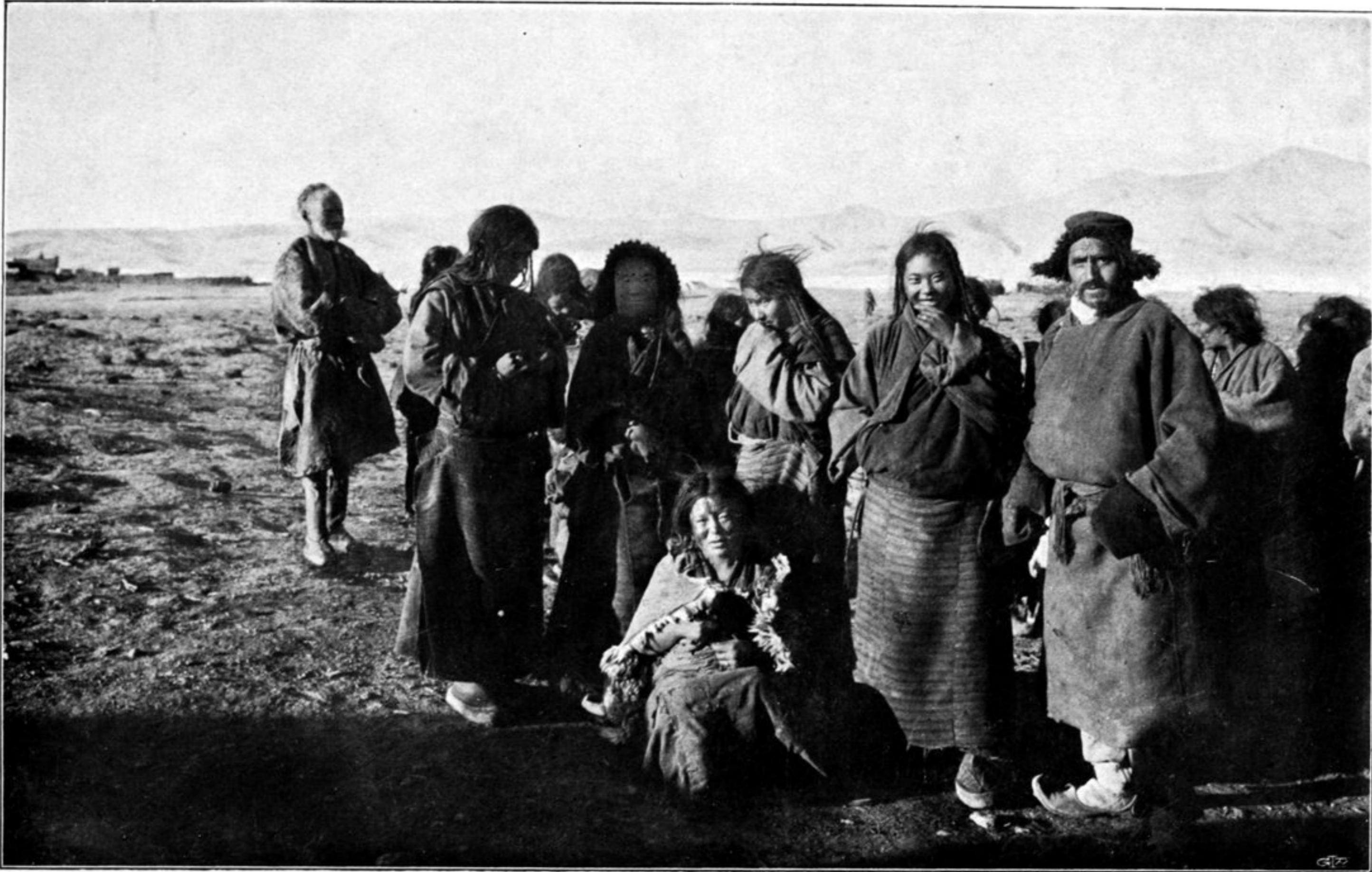
A LADAKI AND SOME TIBETAN WOMEN AT GRATOK.