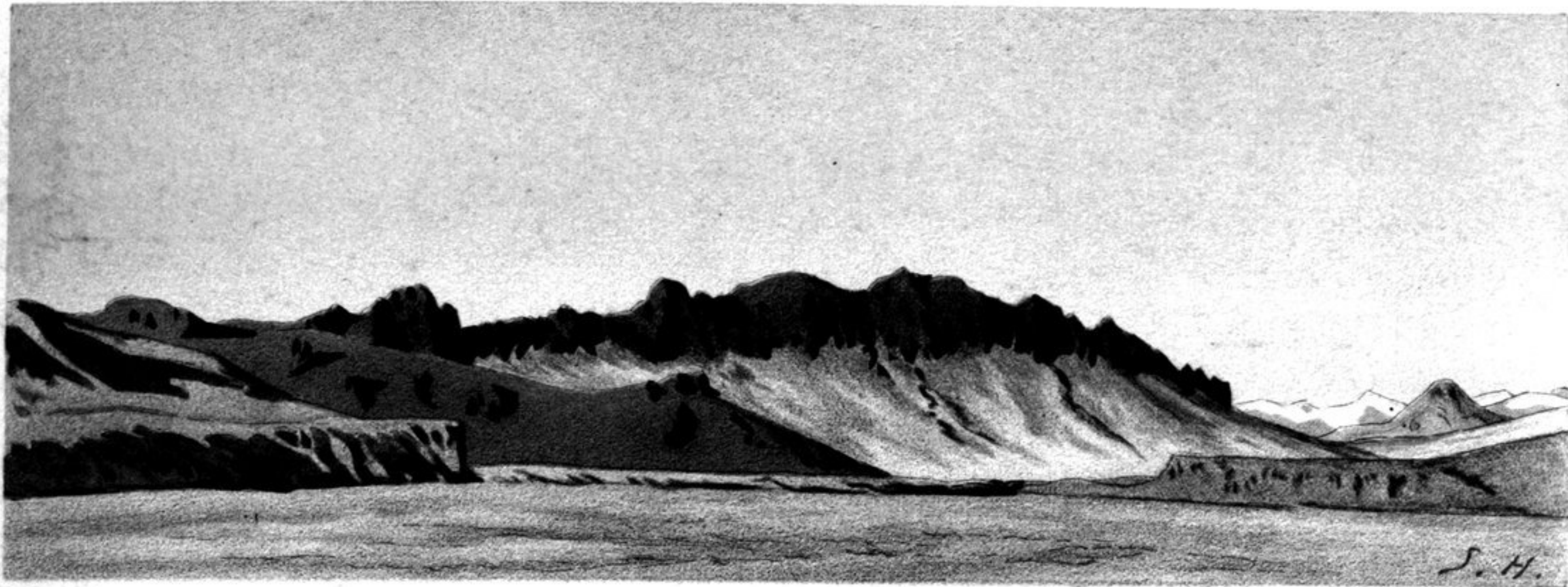
LOOKING N. N. W. FROM CAMP 307.