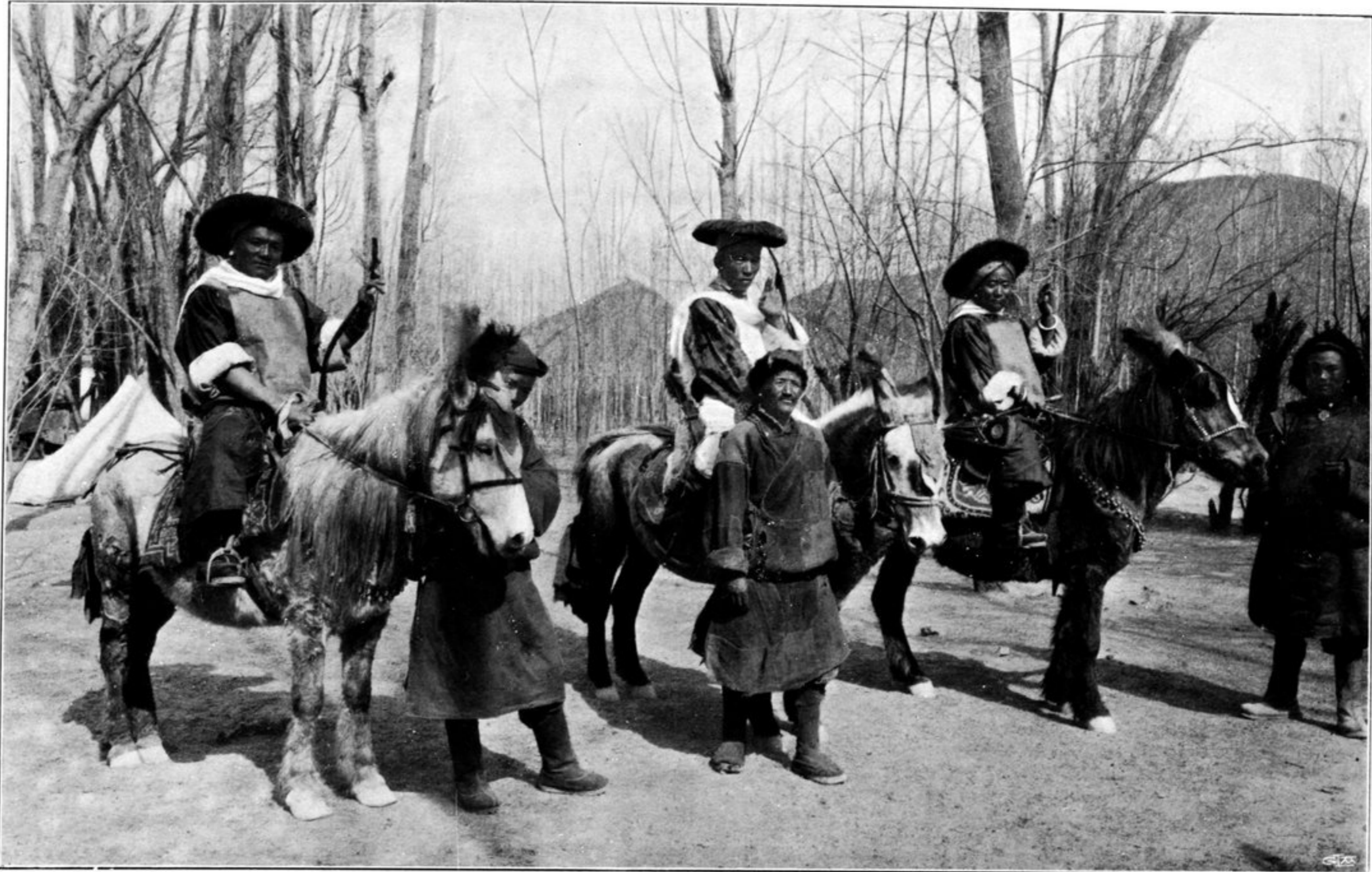
SOME OF THE MEMBERS IN THE SHOOTING COMPETITION AT THE NEW YEAR FESTIVAL IN SHIGATSE.