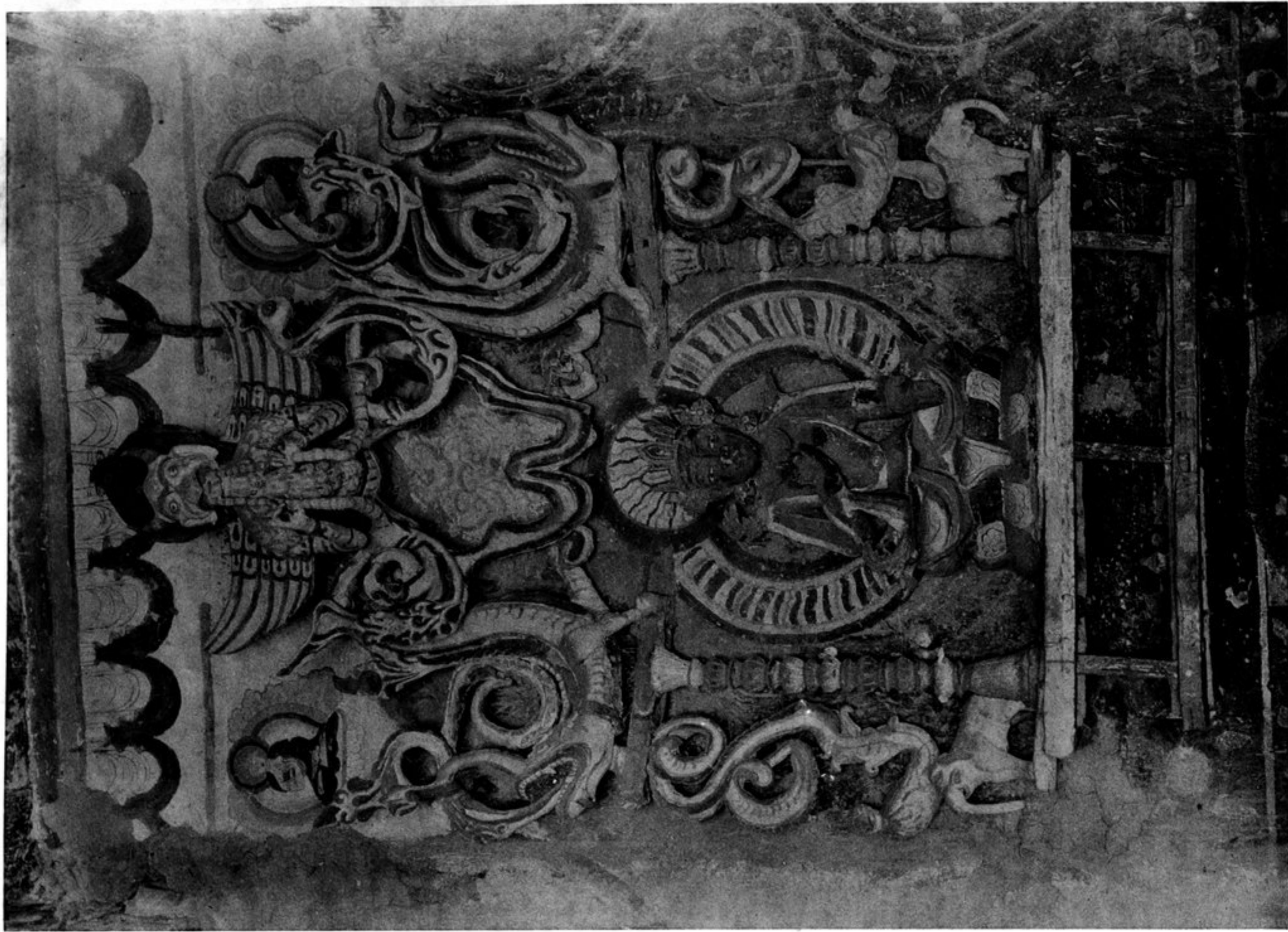
b. Figure of sGrol-gser or the yellow Tara in the Lotsabai Lha-khang Monastery, Nako.